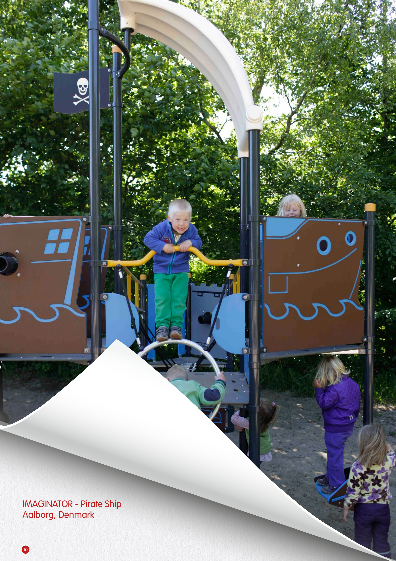
IMAGINATOR - Pirate Ship Aalborg, Denmark