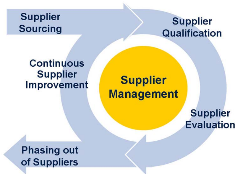
Gemaco Supplier Management Process

The Gemaco supplier qualification and certification process consists of the following steps: