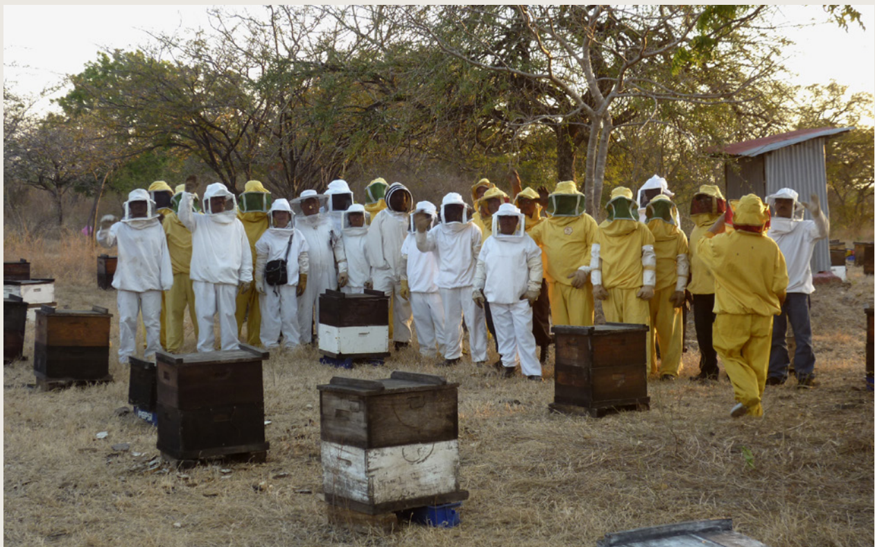
Beekeepers being trained at the Ingemann Beekeeping Academy in Nicaragua.

Implementing these objectives in a company's business strategy helps reduce the risk to the business, but it can also make a company more profitable and produce business opportunities. A fair salary can minimize costly employee turnover, saving energy can reduce expenses and high health and safety standards can limit loss of working days. A good reputation may also create new business.