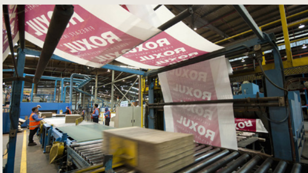
Rockwool Thailand, production of stone wool.

IFU manages the Danida CSR Training Fund, which can provide training grants to IFU's project companies. In 2013, IFU made grant commitments for 12 CSR training programmes. The project companies show considerable interest in applying for these grants. The total annual budget is DKK 3m.