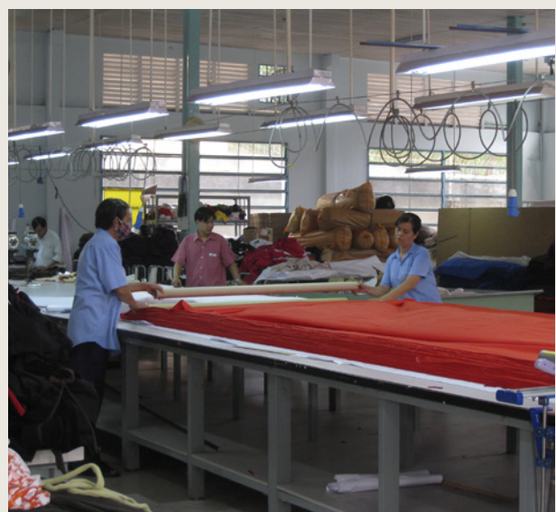
Production of textile at LTP Vietnam.

In 2013, compliance assessments were carried out for 172 IFU projects and 2 AIF projects. The exercise did not include 20 projects that were in the process of being established, 19 projects with no physical activities, and 9 projects being exited. Similarly, for IØ, compliance assessments were carried out for 28 projects. The exercise did not include four projects with no physical activities and four being exited.