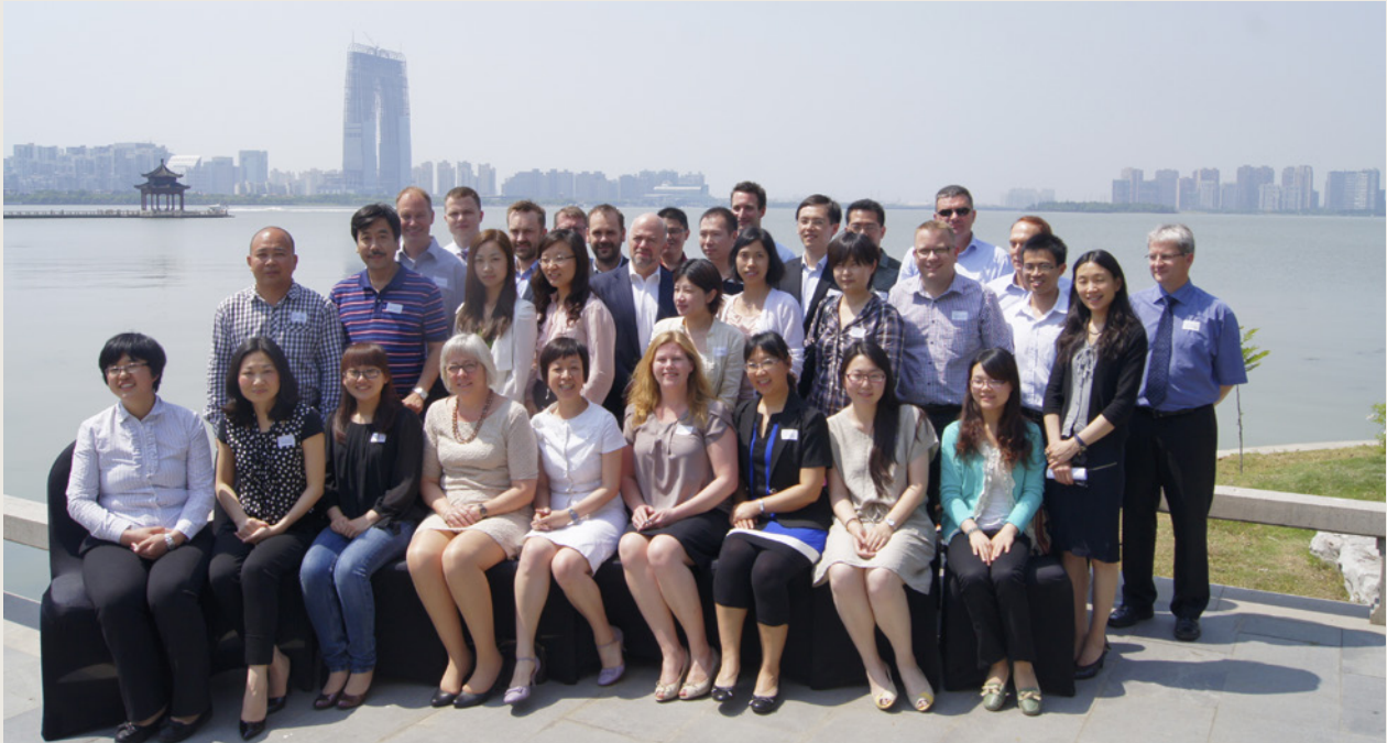
Participants in IFU FOCUS China in 2013.