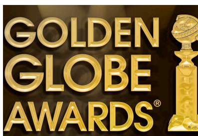
2013 Golden Globes custom confection featuring Omanhene chocolate.

In 2013, the Omanhene story and its Global Compact affiliation was told in Hollywood at the Golden Globe Awards presentation as our chocolate was part of a custom-designed confection: a jam-filled truffle produced with partner Prima Dolce.