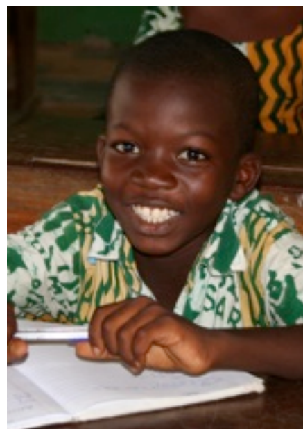
Student at First Star Academy, a private school close to Omanhene's production facility in Ghana.

Our operations in both the Ghana and the US are subject to well-developed and well-enforced local fair labor regulations which assure a level of compliance more stringent than many of the international human rights laws.