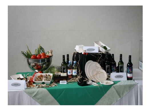
Bio degradable utensils and crockery