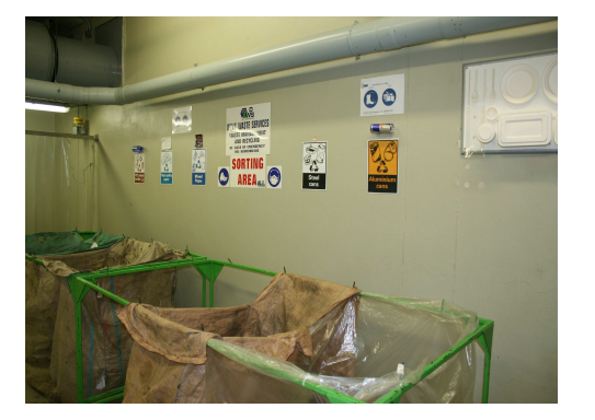
CTICC Waste Sorting Area