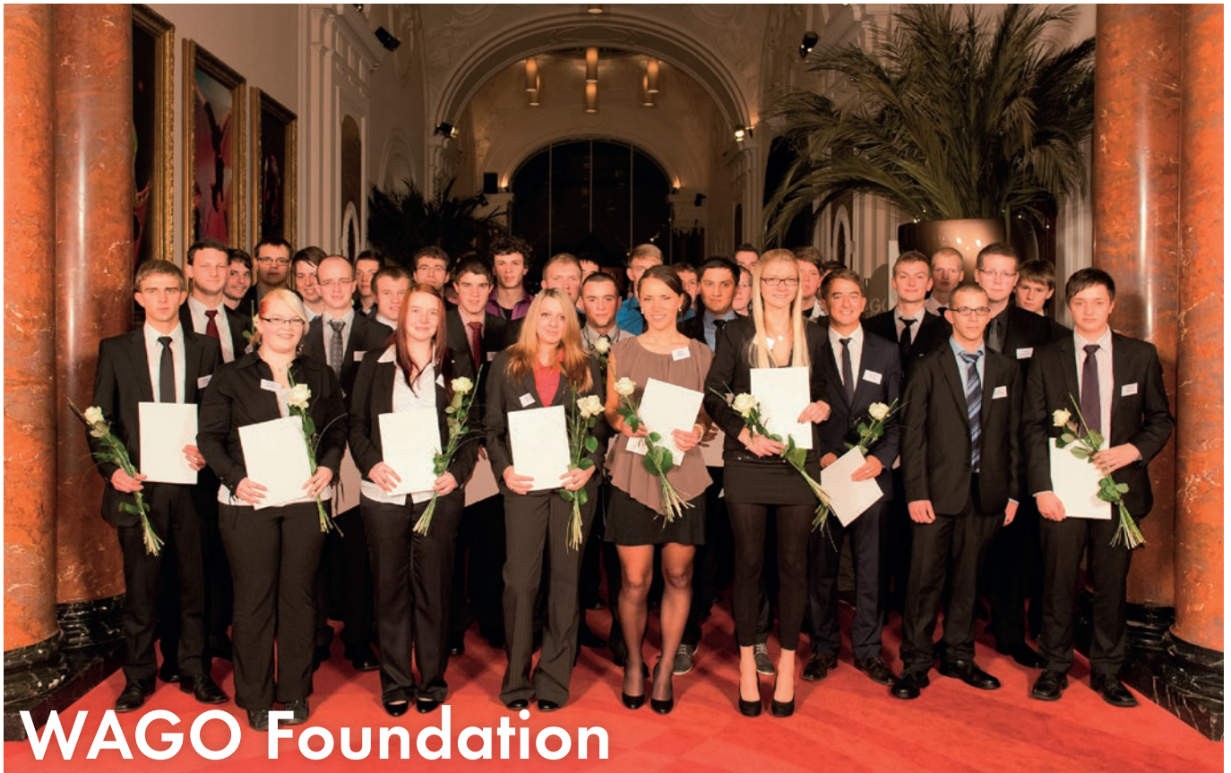
WAGO Foundation prize winners

WAGO supports education and on-the-job-training. The WAGO Foundation awards a prize of up to 1,000 euros each year to its three best graduates from nine different skilled trades in Minden, where the company's headquarters are based, and in Sondershausen, home to WAGO's main production site. Since its establishment, the foundation has bestowed awards on in excess of 550 apprentices from over 110 companies for their special achievements with a grant volume exceeding 400,000 euros. WAGO also makes regular free donations of its products to universities and schools for the purpose of promoting education. For example,