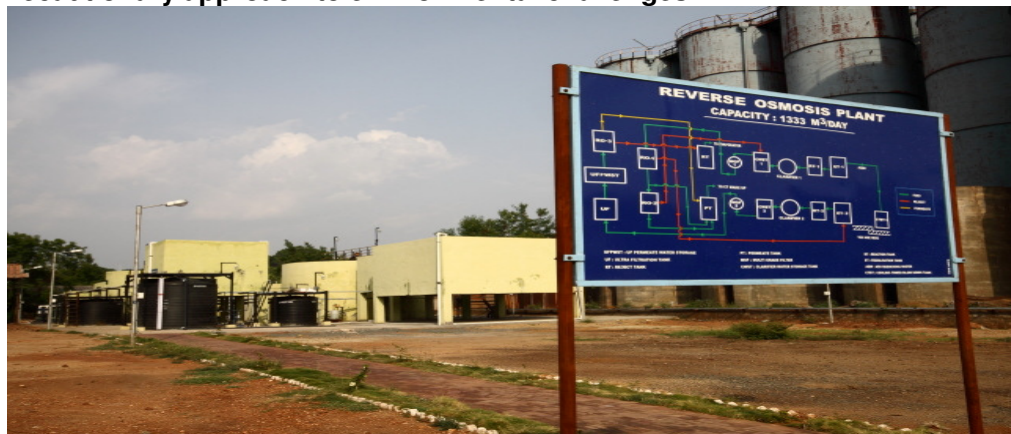
Reverse Osmosis Plant

In order to conserve water, steps have been taken to commission Reverse Osmosis Plant to treat and reuse the waste water back in the process. The rejects from Reverse Osmosis Plant are treated in an Evaporator.