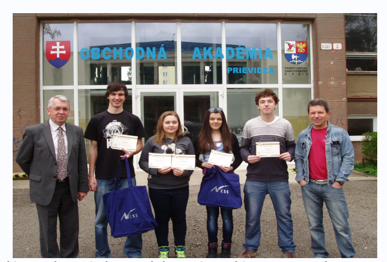
Ness Slovakia employee judges and the Junior Achievement student competitors

Ness employees judged the student competition of "Junior Achievement" focused on increasing tourism to the region. "Junior Achievement" is a not-profit organization that brings volunteers into the classroom to teach students the essence of business through a hands-on curriculum. The winning team was a business administration-focused secondary school, the Business Academy, from Prievidza in Slovakia.