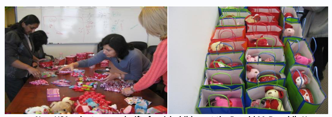
Ness USA volunteers pack gifts for sick children at the Ronald McDonald's House

The Ronald McDonald House creates a home away from home and supportive community for families of children with life-threatening illnesses receiving treatment at local hospitals. This year we hosted a Father's Day event at the Ronald McDonald House where employees prepared and cooked a meal for about eighty people. Our employees also assembled 40 boxes for distribution to children in hospital on Valentine's Day.