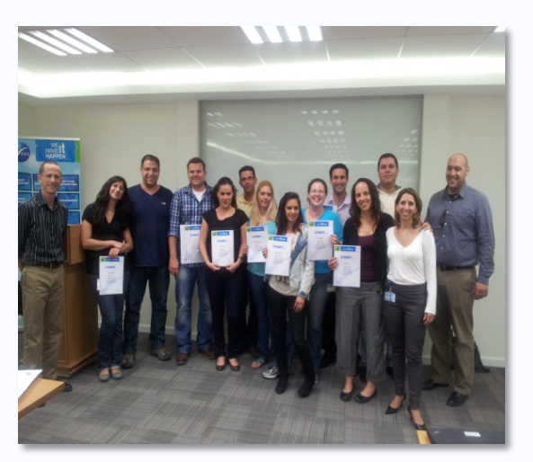
FLMs take part in a dedicated management training program

In 2012, we launched a program for the support and professional development of the FLMs. We began by applying a systematic identification method which allowed us to differentiate FLMs as a unique group within the management structure (rather than as part of the general employee category as before). This has enabled more focused communication with FLMs, in line with Ness's communication plan, in a way that ensures new strategy and updates reaches all employees under their responsibility.