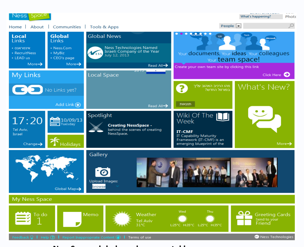
NessSpace global employee portal homepage

NessSpace is a SharePoint Web Application based Platform (Microsoft Windows 8). This is the most advanced technology available and it is highly user-friendly. For instance, the site is separated into tiles to provide ease of navigation for users, similar to smart phones