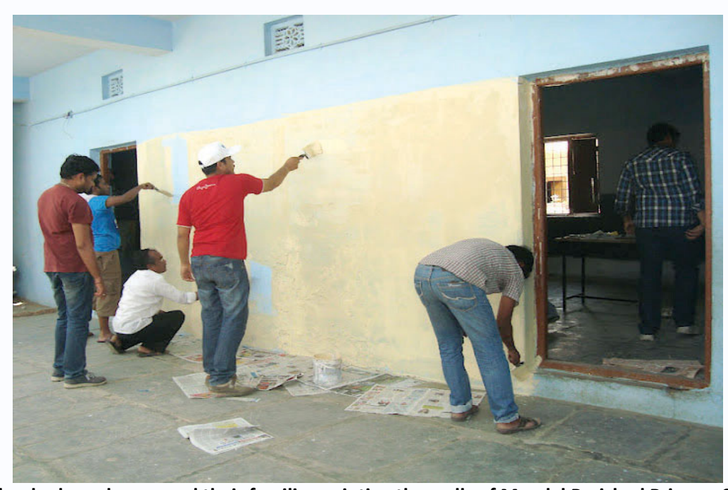
Ness Hyderabad employees and their families painting the walls of Mandal Parishad Primary School