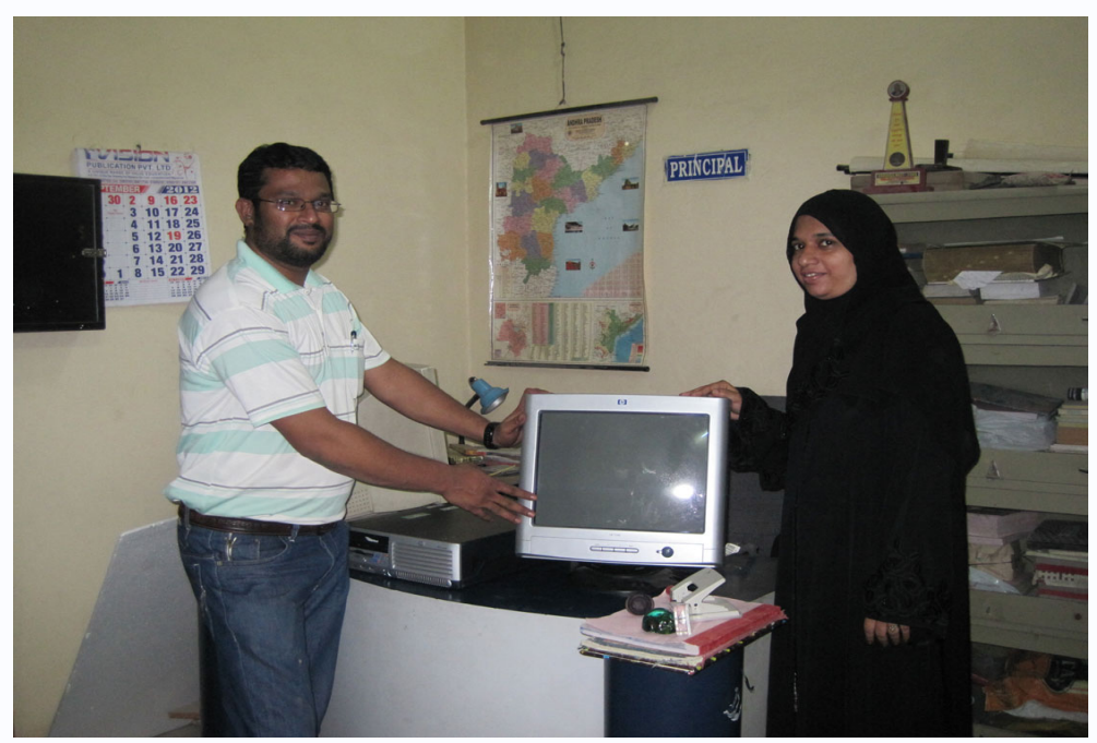
Ness Hyderabad donated 20 computers to five Government schools

Ness India employees took part in additional community service activities during the year.