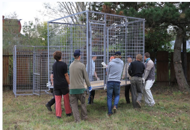
Ness KDC employees build dog kennels for the OAZA Homeless Shelter