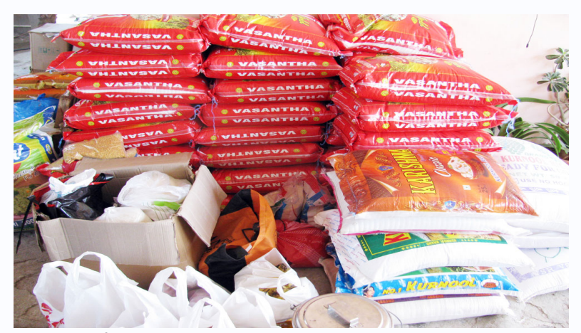
Ness Hyderabad's rice, dal and oil donation to the Kamalamma Old Age Home

Ness Bangalore employees engaged in the following activity: