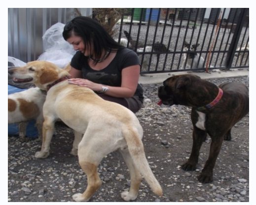
Košice employees collected needed supply for the Košice Animal Shelter

Košice, the biggest city in Eastern Slovakia, has a growing problem with street animals. The animal shelter in Košice is already at full capacity and has little funding for needed supplies. Our employees started a collection for equipment to support the new born puppies. They also bought dog food and donated everything to the animal shelter to continue its care for these stray animals.