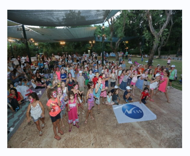
Ness employees and their families enjoy activities organized by the Ness Welfare Program