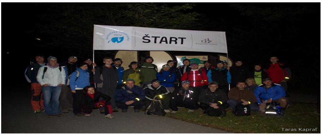
Ness employees take on the Carpathian Wander to fund-raise for Carpathian Foundation

The Carpathian Foundation supports projects in eastern Slovakia to assist the development of its diverse communities, encourage local partnerships and help grassroots not-for-profit organizations and local government. This year, 14 employees undertook the "Carpathian wander" – a trail of 50 km through the Ridge of Volovske Mountain – to fundraise for these projects. The event raised Euro 3,030.