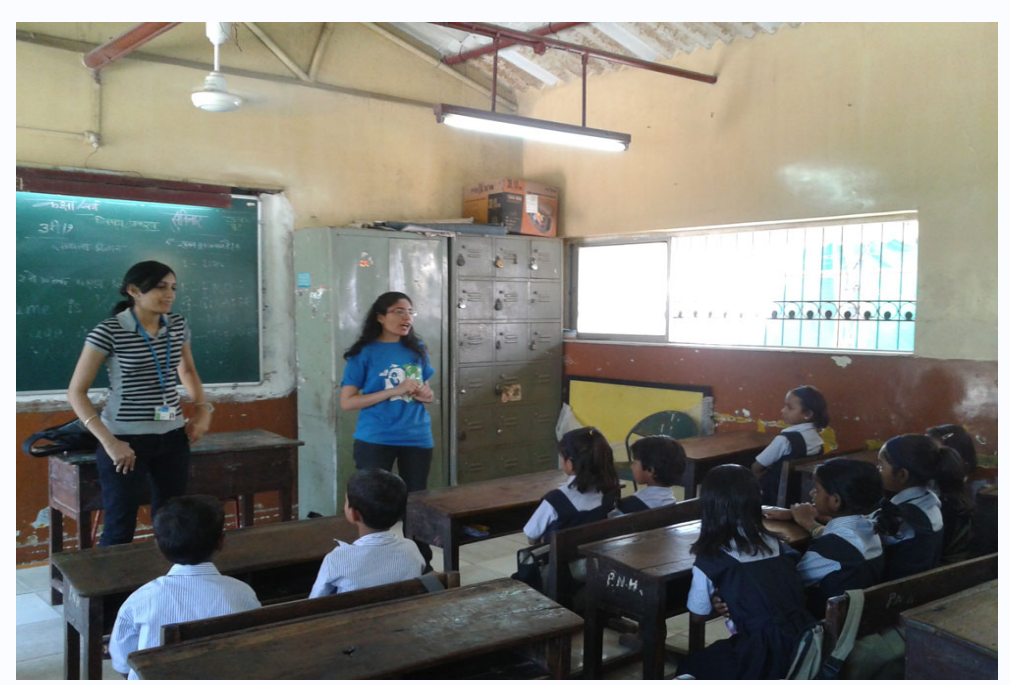
Ness employees teaching English classes in Pratiksha Nagar BMC School in Mumbai

Paint-the-school Drive: Ness Hyderabad employees and their families painted the walls of the Mandal Parishad Primary School to give the school a new look. Over 60 Ness employees dedicated two full-days to the project.