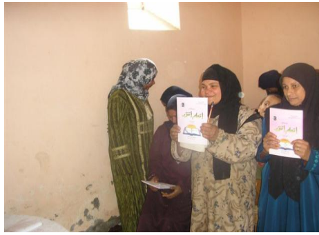
“ the sons of Kassem El Masry NGO headquarters Menya Governorate”