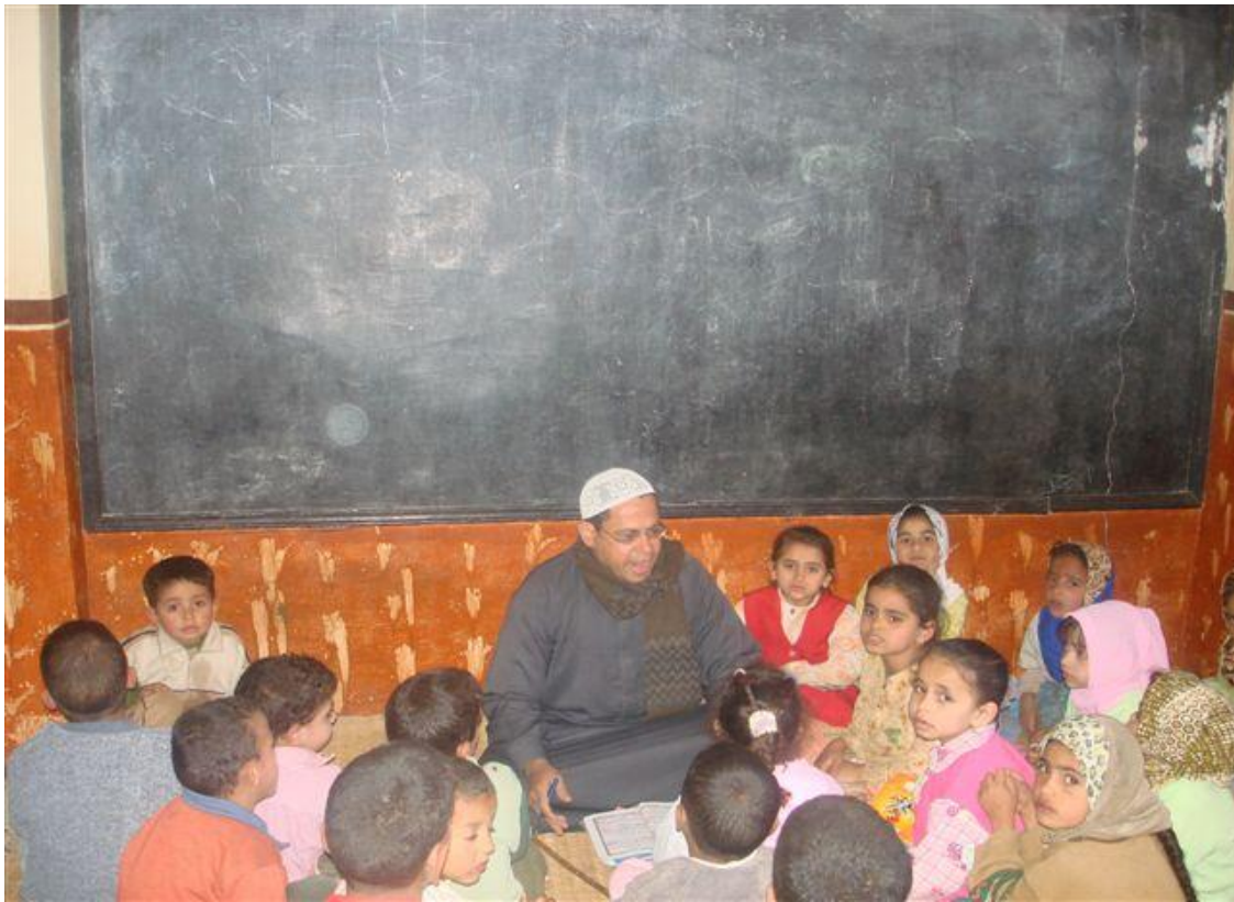
“The professor teaching his young pupils sitting on the floor which is the Egyptian traditional way of teaching

Hashem Brothers Company has built a center for traditional education in the village “Kafr El Shorafa” Kalyoubeya which cater to the children of this village and some nearby villages.