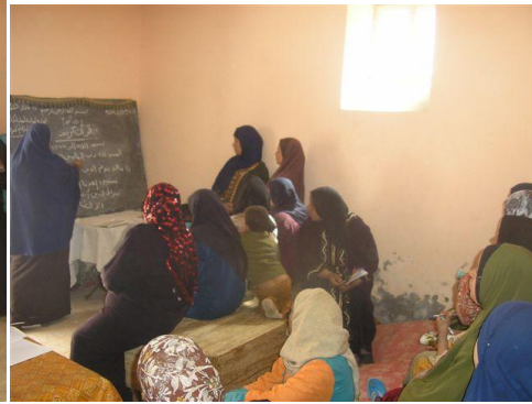
The ladies of Kafr El Madawer village learning in a friendly atmosphere.