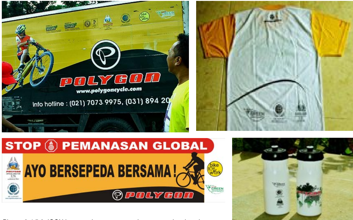
Picture 3,4,5,6: IGCN logos and green community on operational truck T shirt , banner and drinking bottle

As Bicycle manufacturer company, we are very concern to environment issued, which every moment on our promotion communication always get go green theme and stitch up go green logos such us drink bottle, t shirt, operational car, banner, poster etc.