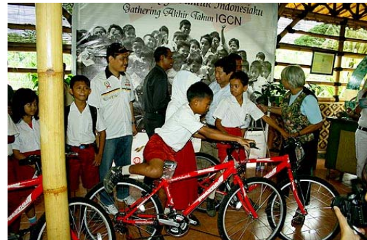
Picture 9 and 10 : ambience of CSR programme with title “ 1000 polygon bicycle for education and children” bicycle yielding on Kampoeng Djamu, December 2009

b. Bicycle Coaching Clinic , throughout bicycle coaching clinic, we conduct training to cyclist how to be good bikers, and the other side we campaign that saving health environment could start or beginning from use bicycle as part of their life.