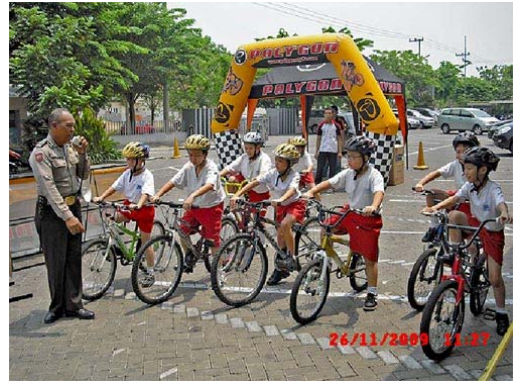
Picture 13 and 14 : Ambience of Safety Riding Clinic for elementary student, November 2009

d. Scholarship, We have been conducted twice per years. Purposes from this programme, we believe, through students are the good way, as ambassador to promote idealism value regarding go to school by bike for green environment.