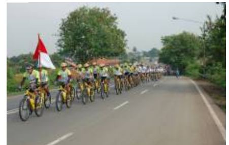
Picture 44, 45, 46, 47 : Ambience of UNFCCC summit, and opening trip ceremonial by President of Indonesia