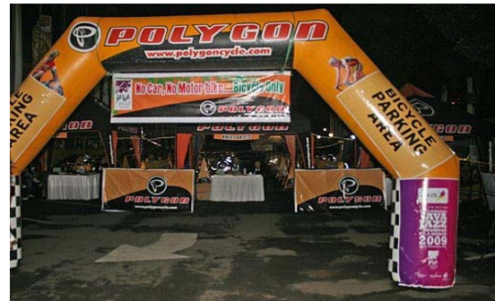
Picture 8 : balloon gate on Bicycle parking java jazz festival, February 2009

In the section of event activities, we also conducted some event that promote green environment throughout as follows: