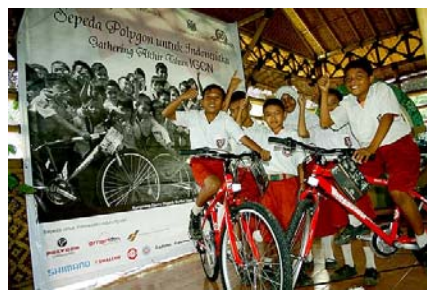
Picture 41, 42, 43 : Poster CSR 1000 Bicycle and yielding at Jogja and Kampoeng Djamu, IGCN