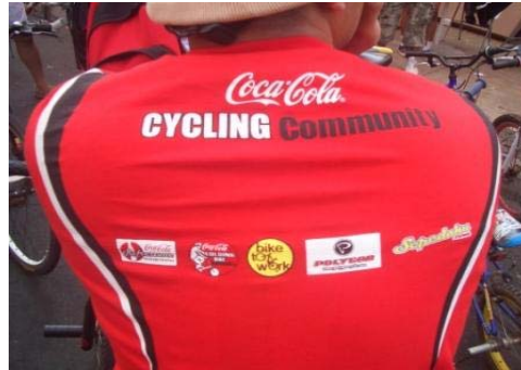
Picture 31, 32, 33 : Special model bicycle for coca cola and C4 car free day supported by Polygon