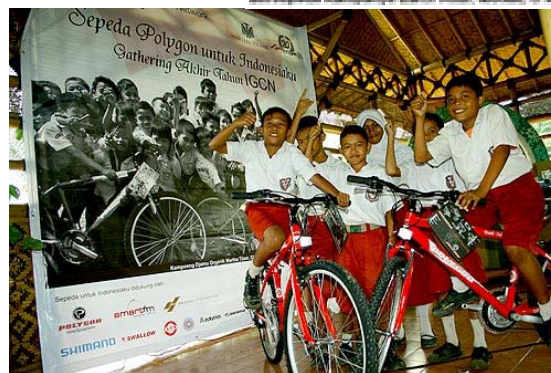
Jakarta, February 2010