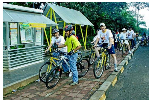
Picture 25, 26, 27, 28 : Special bike model dedicate polygon to University of Indonesia and bicycle shelter and track supported by polygon