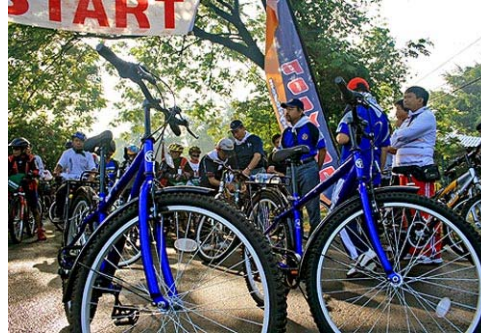
Picture 29, 30 : Special bike model dedicate polygon to Bogor Agriculture Institute

4. Conducting partnership with coca cola company to support green environment campaign , through make special bicycle product with coca cola theme design . For information, Coca cola have got community, which mention it by Coca cola Cycling Community (C4). They are active to promoting green environment within each green event such us “Car Free Day” and also polygon create coaching clinic to them.