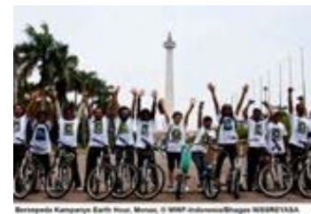
Picture 18, 19, 20, 21 : Campaign Poster of Earth Hour and support by polygon

2. Conducting partnership with Bike to Work organization (B2W). For further information, B2W is non profit organization that make movement to provide a place for everyone that daily use bicycle to go work. For time being, noted approximately less and more have got 10.000 members divide entire Indonesia cities, since their declared 2005. They have got mainly purposes as organization that focus on "bike to better global environment" campaign. Polygon as bicycle manufacturer concern to support their movement with conducted something such us: