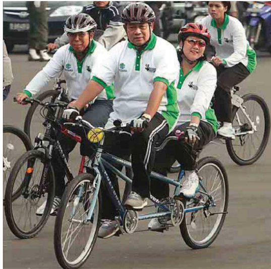
TANDEM: Presiden SBY dengan sepeda tandem membonceng Ibu Negara Ani Yudoyono saat melepas Tim Kampanye Bersepeda di Lapangan Monumen Nasional, Jakarta, kemarin.