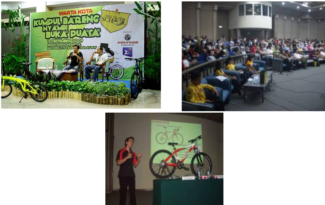
Picture 38, 39, 40: Ambience of seminar and coaching clinic at University of Indonesia and Bike to school Kompas Gramedia

6. Collaboration with biggest media in Indonesia, Kompas Gramedia Group, initiate to develop program “ Bike to Scholl community “. We active to encourage them and support for their activities to keep their consistency .