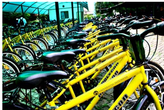
Picture 2: Special product for University Of Indonesia

We realize, employee as greatest asset for us, who without them , are impossible for company could improving it self comply with mission and vision. Herewith, I would like to state that there is no discrimination regarding race, gender, social status, or believing in religion.