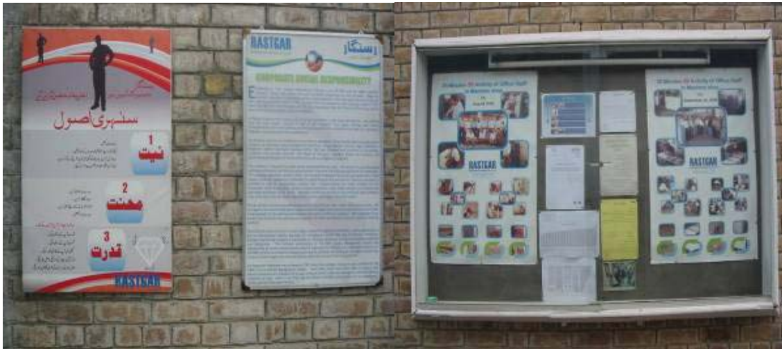
Corporate Social Responsibility, 5S Principles and Golden Principles Notices.

Foreign consultants are engaged occasionally to study in depth the current working conditions. They mix up freely with our work force, obtain first hand impressions and responses from them, and recommend measures for improving the work conditions, productivity and benefits through inculcating team spirit.