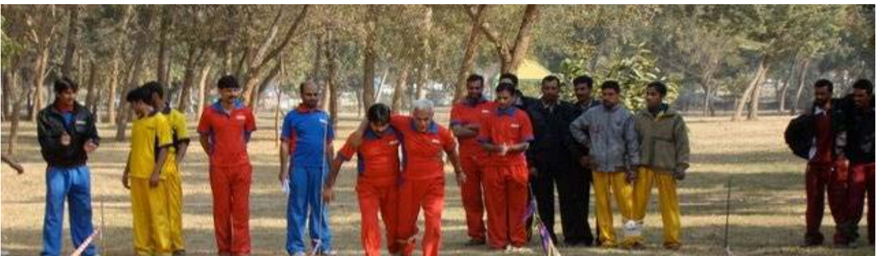
Annual athletics day glimpses Dec 2009