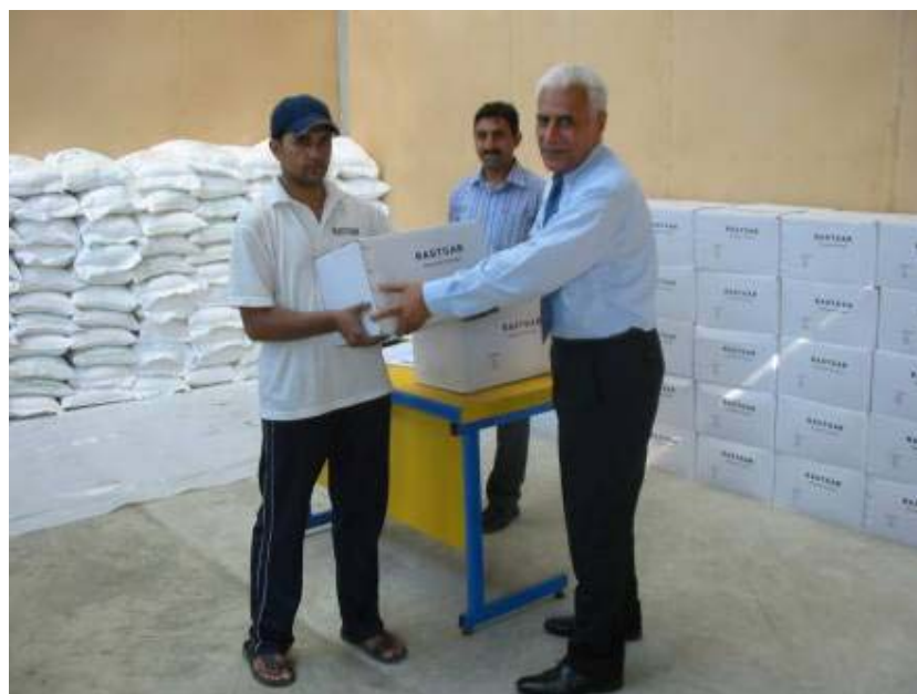
Ramzan Food Packages being distributed among workers Sep 2009.