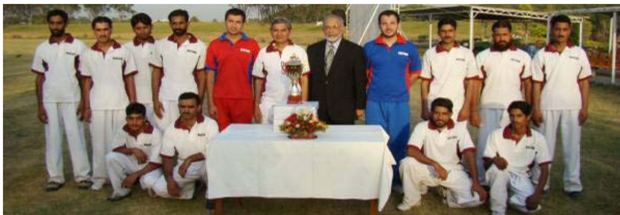
The 2009 Gala winner