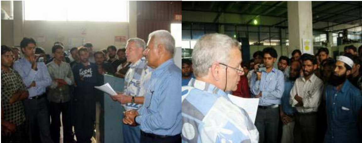
Swiss Consultant addressing the workers and inviting suggestions.