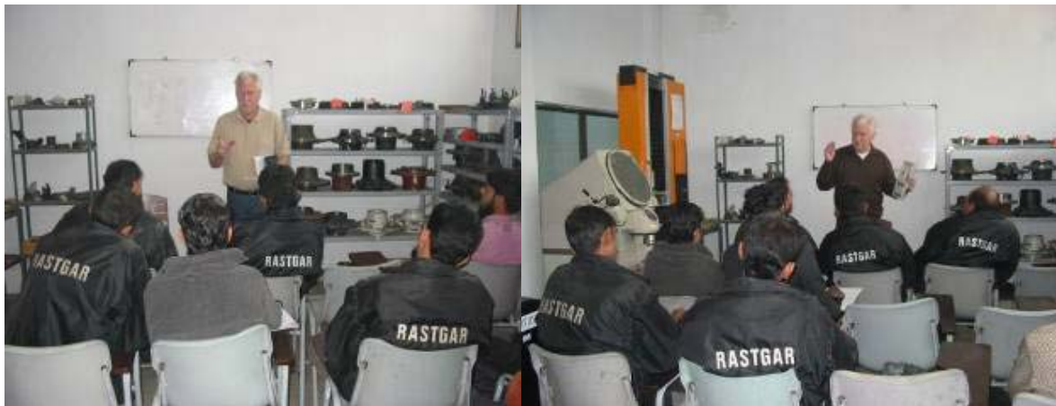
German Expert training REC workers.

Workers are encouraged to participate in various physical fitness, hiking, sight-seeing and cultural events. A record number of 230 workers went this year on sight-seeing tour of the nearby hilly areas. Workers take keen part in individual fitness events like rope climbing, short races, push-ups, sit-ups. Their groups competed for winning positions in 5 km Margalla Hills hiking event. They presented songs, improvised music, one-man shows, comic skits and other numbers to the pleasure of house-full audience.