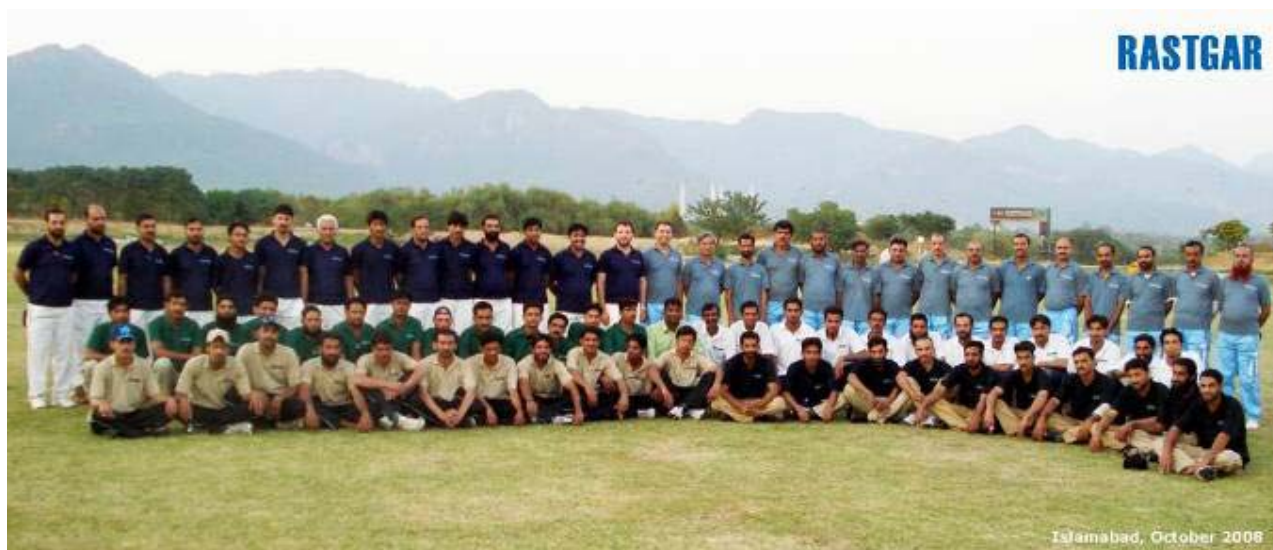
REC Cricket Tournament 2008