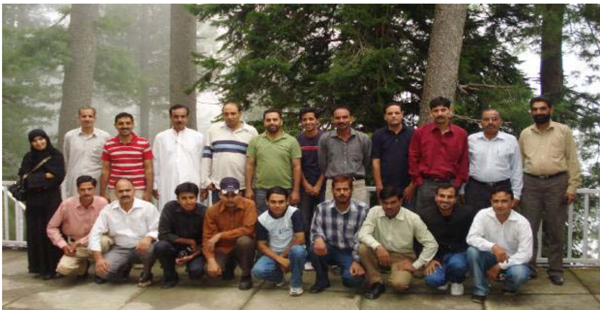
Rastgar Picnic trip to Nathia Galee Murree 2009