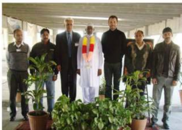
Welcome Hajj Ceremony Dec 2009