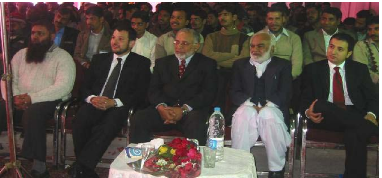
Rastgar Cultural Day audience March 2009