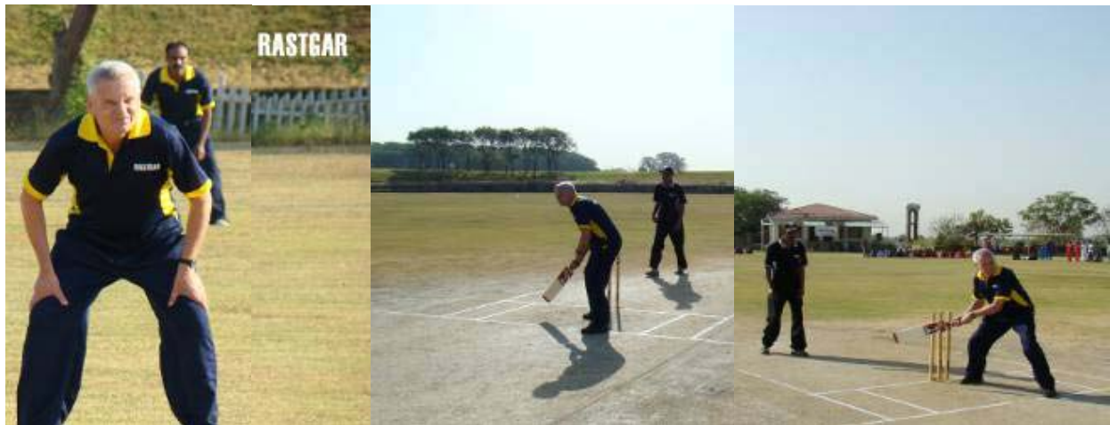
English game, Swiss player, Islamabad Pakistan Ground Oct 2009

Foreign consultants are engaged occasionally to study in depth the current working conditions. They mix up freely with our work force, obtain first hand impressions and responses from them, and recommend measures for improving the work conditions, productivity and benefits through inculcating team spirit.