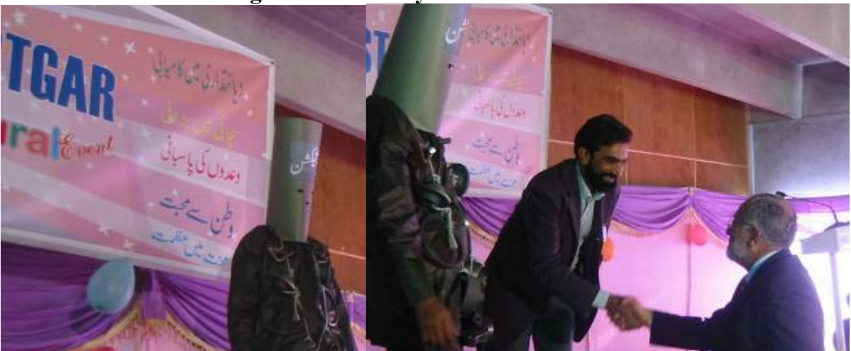
Rastgar Cultural Day skit