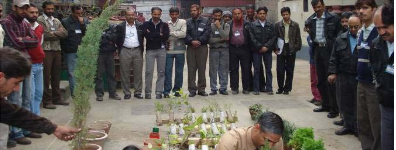
Tree Plantation Day April 2009