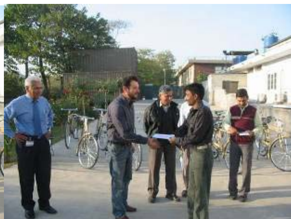
Distribution of Bicycles among workers.