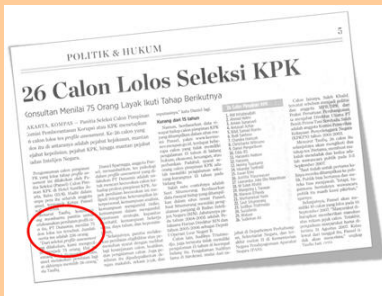
Photo: Article about Dunamis work in a selection panel for the Commission to Eliminate Corruption

Dunamis personnel were members of a selection panel for the Commission to Eliminate Corruption in 2006.