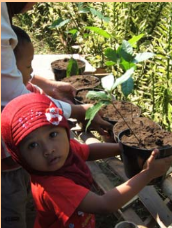
Photo: Planting at Klaten