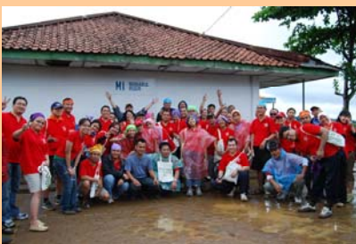
Photo: After Dunamis Amazing Race Program - renovating MI Ar Rahmah

"Dunamis strives to continue being an employer of choice"