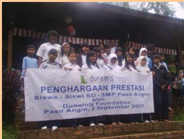
Photo: Penghargaan Siswa Berprestasi Program

"Dunamis encourages environmentally friendly practices"