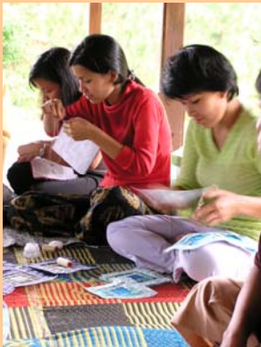
Photo: Women in Pasir Angin learning crafts

"staff at Dunamis can enjoy a healthy company- provided lunch every work day"