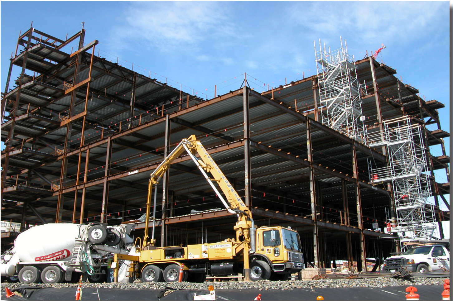
Mills Peninsula Hospital. Burlingame, CA