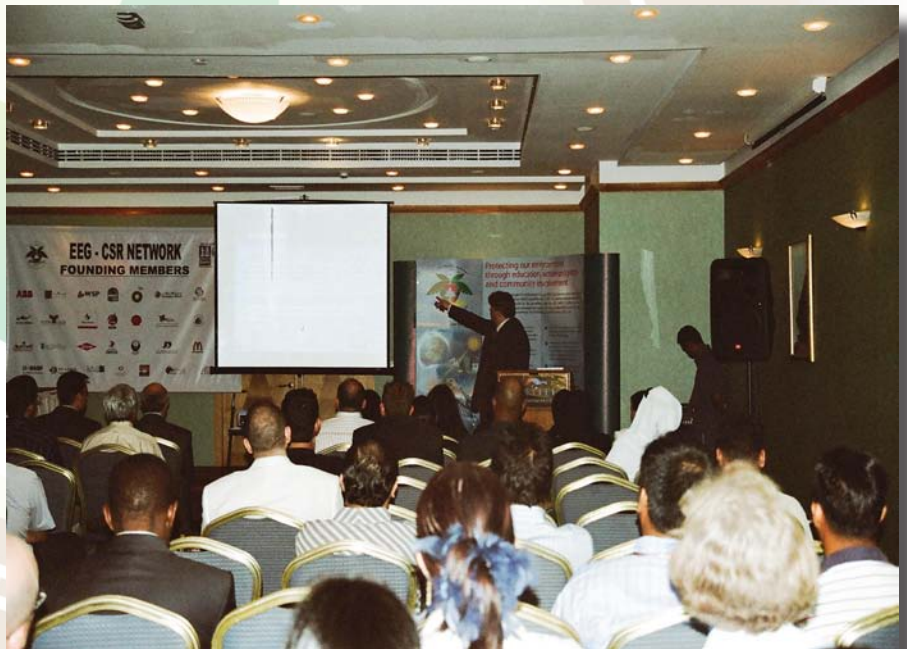
SINAK and Oryx Enterprises, W.L.L. exhibit at the 4th Regional Conference on Protecting the Gulf Environment conference in April of 2008

Since January of 2007 SINAK Corporation has been a member of the Emirates Environmental Group participating in Clean-Up and recycling activities along with community lectures. In May of 2007 in Dubai SINAK Corporation teamed with Oryx Enterprises for a community lecture, hosted by the Emirates Environmental Group, entitled "Building Without Depleting Water Resources Or Polluting The Environment". The lecture focused on the Middle East and North Africa region's rapid construction pace, the amount of water consumed for construction in the region, the effects of such water usage and a way in which to reduce consumption. The same lecture was given in Qatar in November of 2007 at the "Better Buildings" conference hosted by Friends of The Environment. SINAK Corporation supported the Exclusive Agent in Qatar at the 4th Regional Conference on Protecting the Gulf Environment conference in April 2008 when this same lecture was presented.