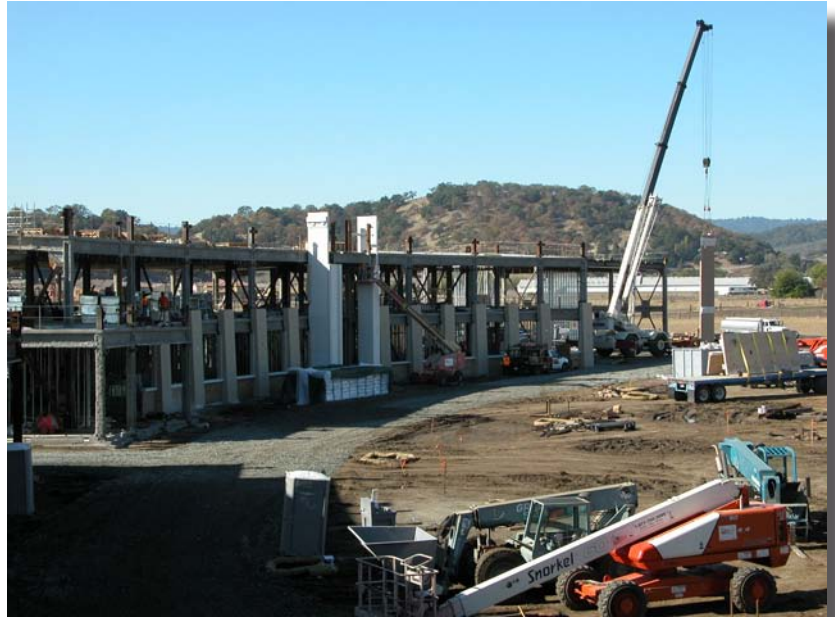
Christopher High School. Gilroy, CA

To develop, manufacture and market a unique family of products that protect, enhance and extend the life cycle of various surfaces in an environmentally friendly manner. To maintain a sterling reputation for integrity and fair dealing and to provide superior technical support and customer service to ensure proper product application.