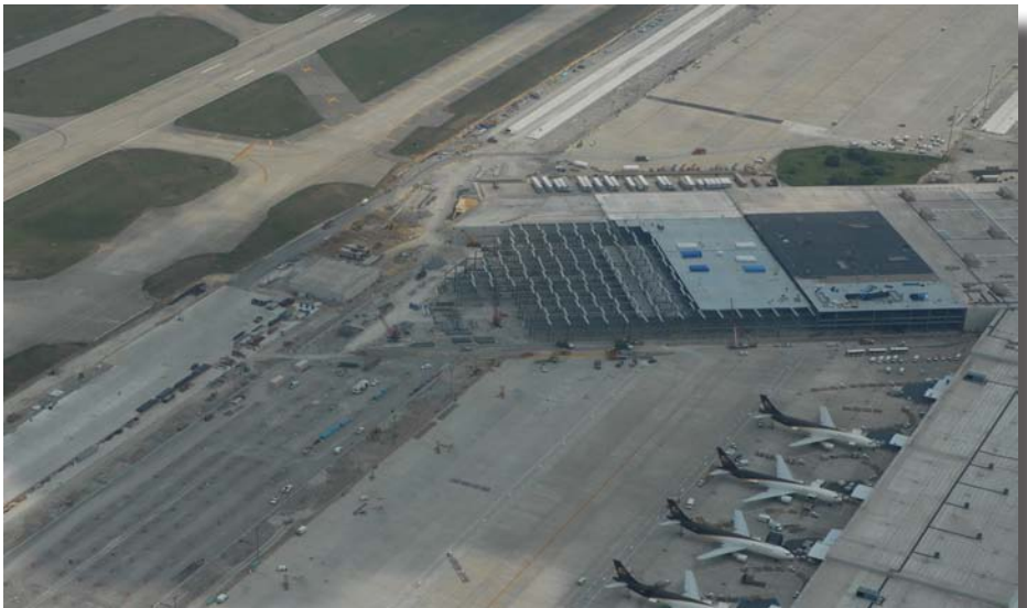
UPS World Hub. Louisville, KY

Fair dealing is at the heart of the SINAK Corporation Mission Statement. SINAK's code of conduct will be expanded to incorporate a policy covering anti-corruption, extortion, bribery and conflict of interest. All of our employees will be provided with a copy of the code of conduct provided by our Board of Directors which will be reviewed and accepted by each employee.