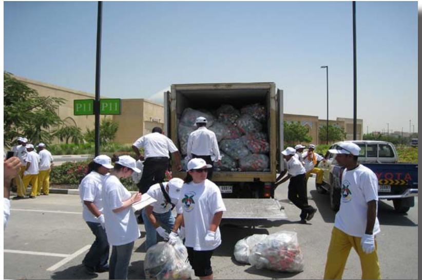
Emirates Environmental Group May 2008 Can Drive in Dubai, U.A.E

We are committed to the highest standards of human rights protection. And although our Board of Directors has ultimate responsibility for decision-making and for compliance with all human rights laws and regulations applicable to our business, it is in the corporate culture at SINAK that no matter the seniority, every employee has the right to speak-up on any situation or in house issue that they are concerns them. The results are seen at the office in that every employee enjoys a positive workspace each day.