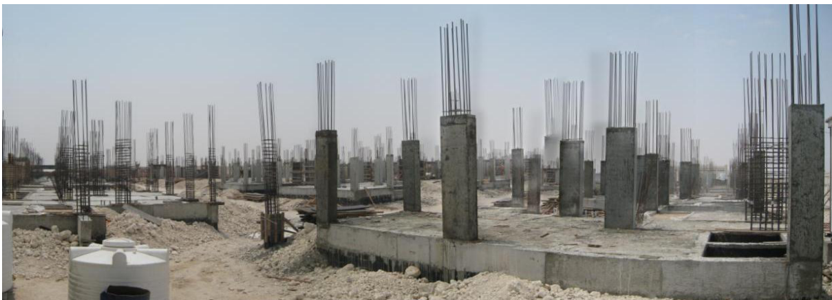
Villa Project. Doha, Qatar

SINAK® VC5™ being used to save in excess of 13.5 million liters of water vs. water cure method*