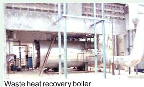
Waste heat recovery boiler