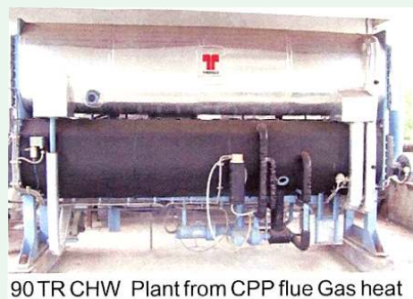
90 TR CHW Plant from CPP flue Gas heat