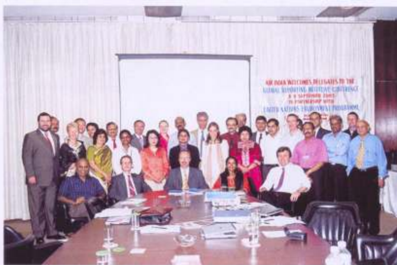
UNEP, GRI & reporting representatives at Consultation Meeting at Mumbai

This report has been prepared using the Third Generation of GRI Sustainability Reporting Guidelines (The “G3”). Rallis was actively involved in the GRI Indian Consultation Meetings held with representatives of UNEP and GRI staff and we have participated in the Indian 'Sneek Peak’ to engage with different stakeholders from different constituencies and receive feedback on the draft of the G3. We have used this exercise to review and identify opportunities for improvement.