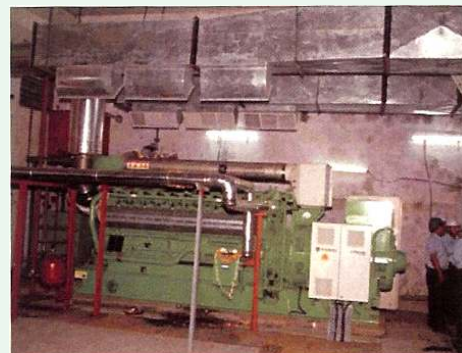
1MW CO - GEN Power Plant (CPP) on Gas

"Polluter Pays". This was a sign of our voluntary approach to protect the community from any impact.