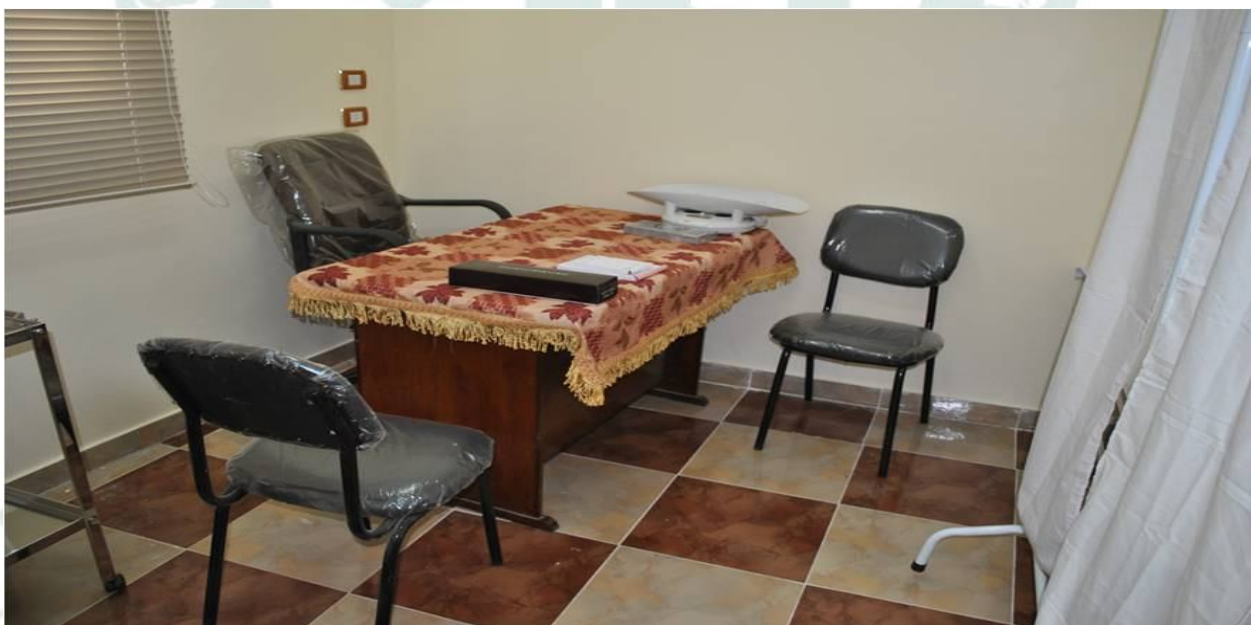
(A picture for the child care clinic)