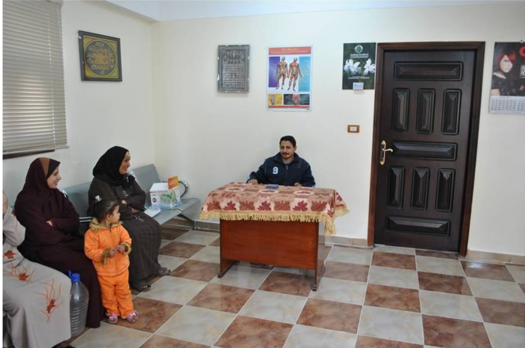
(A picture for the gynaecology clinic)