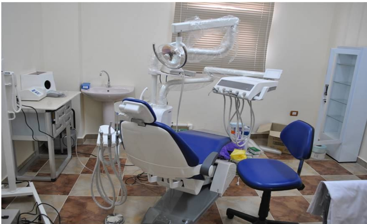
(A picture for the dental clinic)