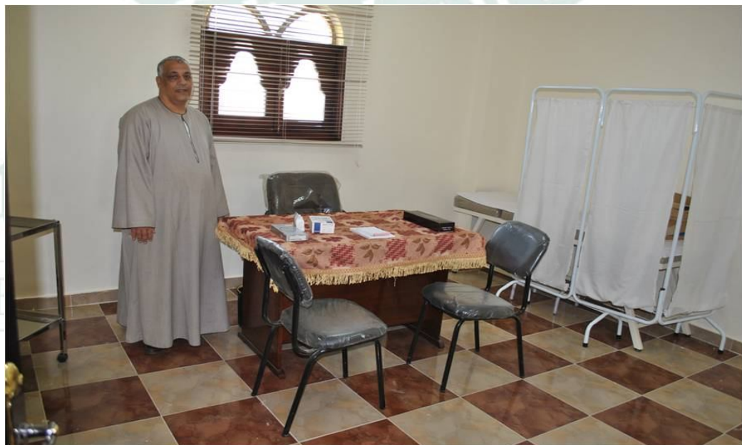
(A picture of the general clinic)