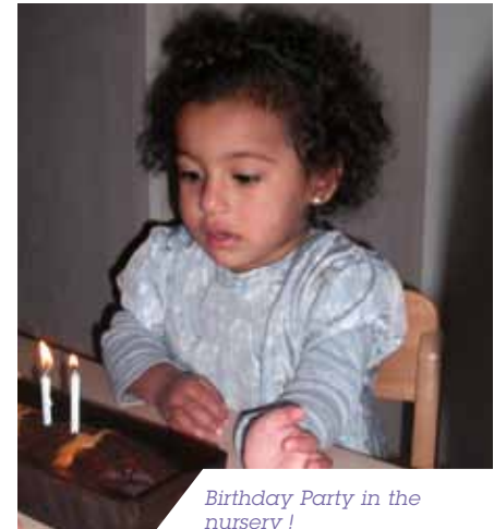
Birthday Party in the nursery!

As an extension of this aim to better reconcile private and professional life for employees, in 2011, the L'OCCITANE Group was also actively involved in financing five places (reserved for workers at the Lagorce site) at a day care centre under construction in Vogué (Ardèche). Again at the Lagorce site, the decision was made to give all employees access to company-subsidized CESU universal service employment vouchers, which have been made available since September 1, 2010.