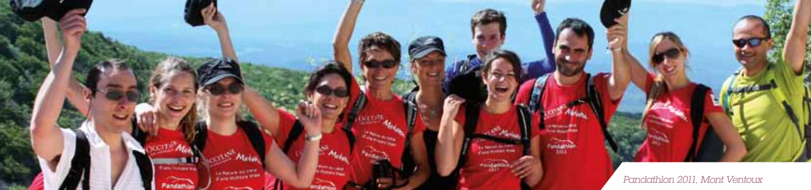
Pandathlon 2011, Mont Ventoux