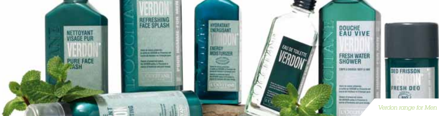
Verdon range for Men