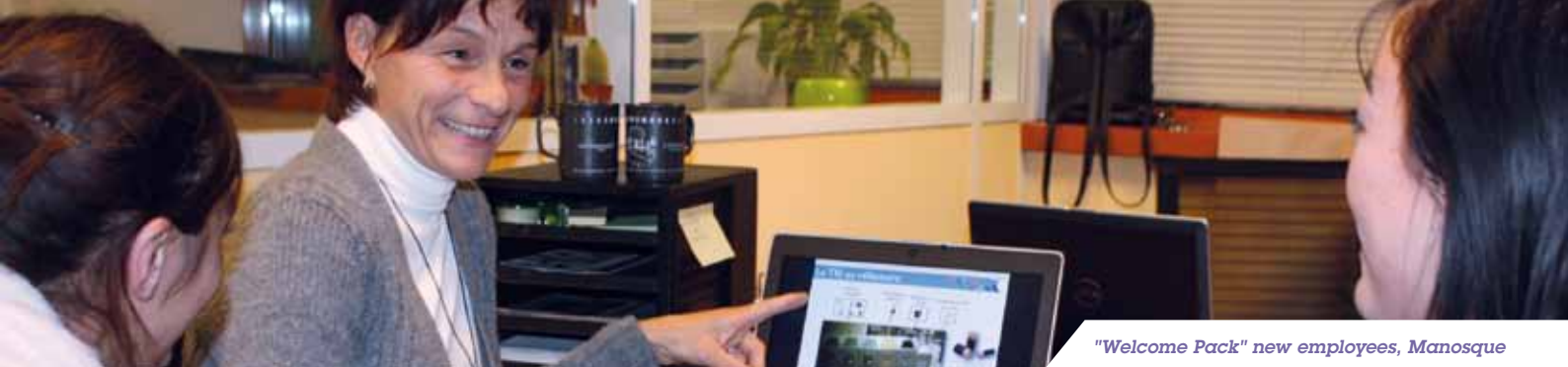
"Welcome Pack" new employees, Manosque

In parallel, in an ongoing effort to improve the work environment and keep employees informed as much as possible, several round tables were set up so that they could listen, share and discuss at every level of our organization. As a result, several points of focus were identified, such as the necessity of sharing information so that everyone can move forward at the same pace, or more rapidly developing skills and career opportunities.