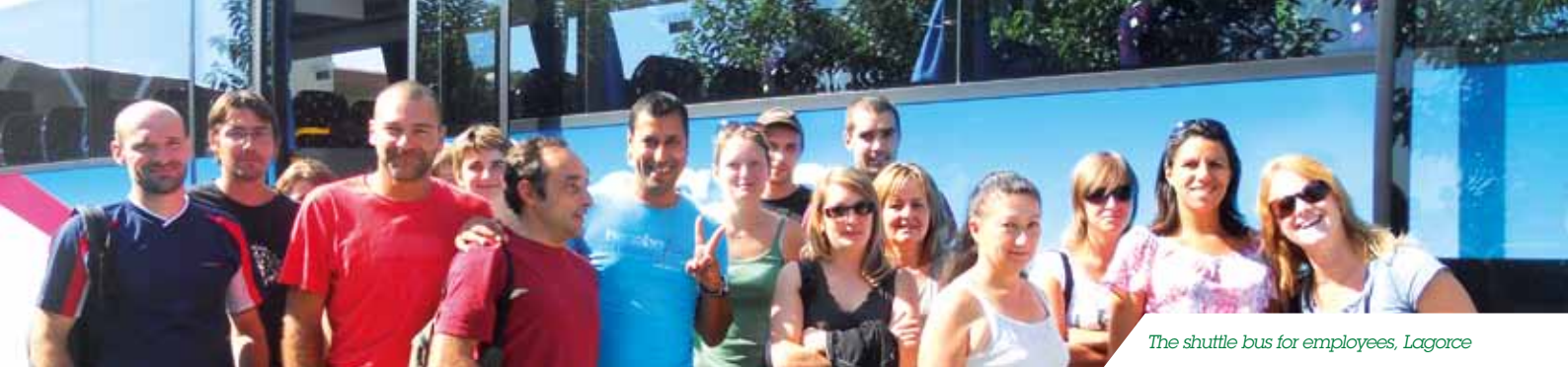
The shuttle bus for employees, Lagorce

at reducing individual car trips from home to work. There are two main points of focus: