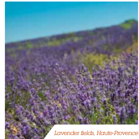
Lavender fields, Haute-Provence

deforestation in south-east Asia for many years. We do not actually purchase palm oil directly, but we do buy supplies of raw materials that contain palm oil, such as soap flakes.