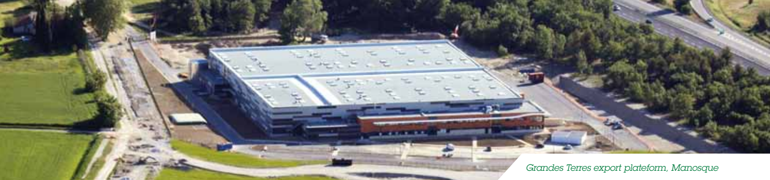
Grandes Terres export platform, Manosque