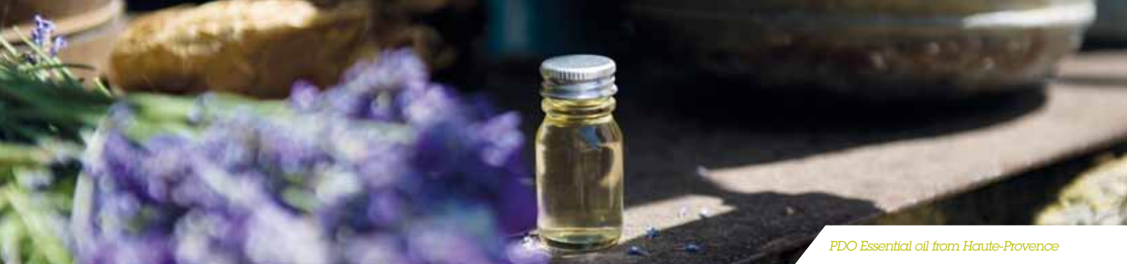
PDO Essential oil from Haute-Provence

CONTINUOUS IMPROVEMENT: we revise our formulas should any questions arise regarding the ingredients we use in relation to health (parabens, phthalates, BHT) or the environment (silicones, SLES), and in doing so, anticipate changes to legislation.