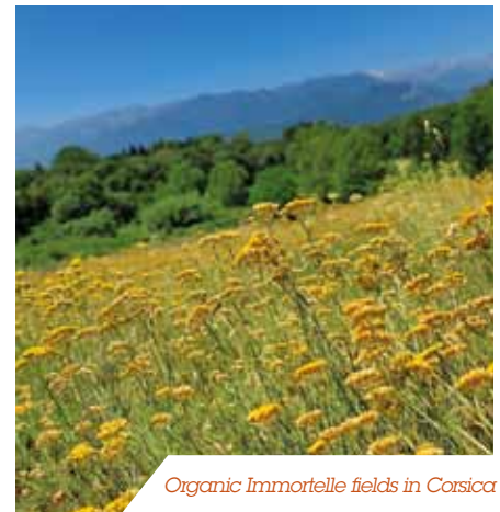
Organic Immortelle fields in Corsica

This year, small-scale distillation trials are being carried out so that the immortelle can be harvested at the very best times, thus preserving all the richness of the plant and ensuring that it grows back very well the following years.