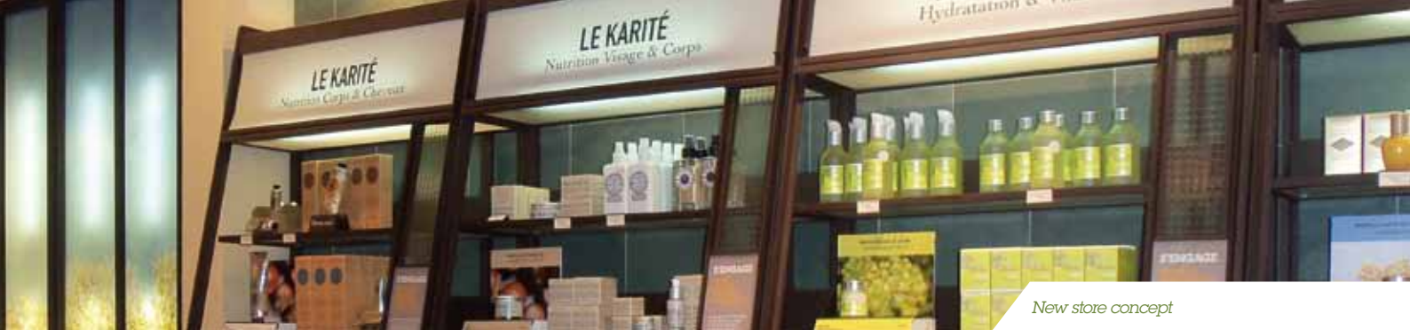
New store concept

In order to ensure that environmental considerations are taken into account at every stage in the construction or renovation of a store (design, planning, work), a checklist has been drawn up to remind all departments concerned. This checklist has already been tested on a few pilot stores and will become standard for all projects throughout the world in 2013.