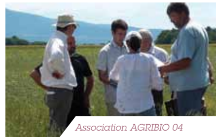
Association AGRIBIO 04

ENCOURAGING ORGANIC FARMING AGRIBIO 04 is an association that unites organic farmers from the Alpes de Haute-Provence region and is dedicated to developing and defending organic farming. L'OCCITANE supports this association by helping to finance its "Objectif Bio 2013" project. The objective of this project is to increase the area of organically farmed land in the Alpes de Haute-Provence region so that 20% of land is organically farmed by 2013. The aim is to make this French département the first organic one in France BIO de France.