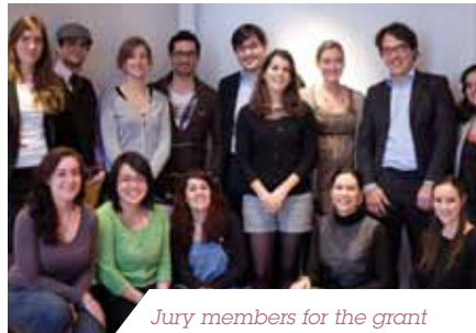
Jury members for the grant

The L'OCCITANE Foundation was created in 2006 and has an average annual budget of 1 million euros.