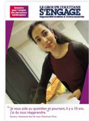
Exhibition of employees' pictures with disability

AFTER THIS DISCUSSION, we made several videos with the people involved, to introduce all employees on the site to learning sign language. In fact, if you get the opportunity, you should ask one of our employees to say "Bonjour" in French sign language!