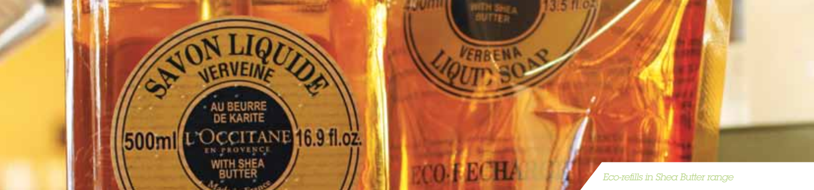
Eco-refills in Shea Butter range

garanti sans colorant Ne jetez pas votre flacon. Afin de participer à l'effort anti-pollution ramenez le chez votre détaillant. Il sera recyclé. Merci