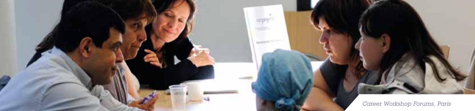
Career Workshop Forums, Paris