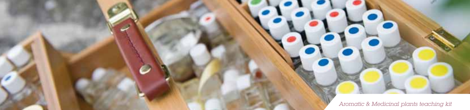
Aromatic & Medicinal plants teaching kit

HIGHLIGHTING AND INFORMING PEOPLE ABOUT AROMATIC AND MEDICINAL PLANTS Within the framework of our patronage in Provence, the European University of Scents and Flavours has acquired a copper distillation still and offers workshops for children and adults, where they can learn about the art of distillation, aromatic plants, and the properties these plants have.