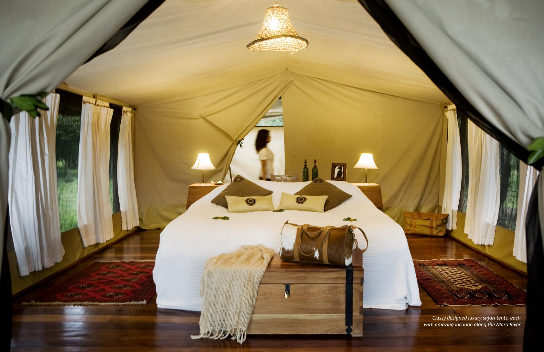
Classy designed luxury safari tents, each with amazing location along the Mara River