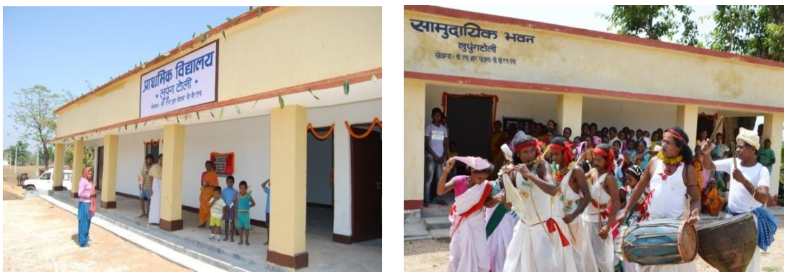
Newly constructed School building & Community Centre at Lupung Toli

• SCHOOL BUILDING: Construction and Repairing works have been done in Seventy Eight (78) Rural Schools.