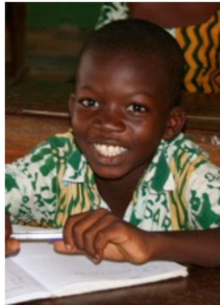
Student at First Star Academy, a private school close to Omanhene's production facility in Ghana.

Omanhene supports the recent effort of the Government of Ghana to undertake a Pilot Study on Child Labour, the first installment was recently published. The Pilot Study (sponsored by disinterested third-parties to assure impartiality) seeks to visit each of the more than 600,000 individual cocoa farms in Ghana and gather data against more than 100 benchmarks. Significant benchmarks include, for example, school attendance by children during the previous week (if children did not attend school the previous week, that might indicate that they are being prevented from attending school and thus subjected to the "worst form of child labor" as defined by international law). The first set of data from the Pilot Study shows that there is no systemic exploitation of child labor in Ghana. This conclusion comports with less scientific, anecdotal reviews.