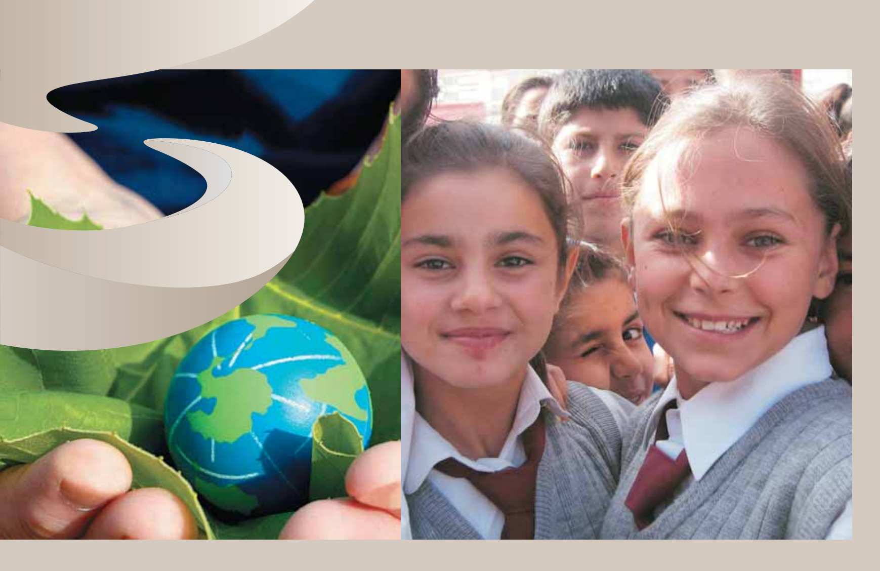
Global Compact Communication on Progress 2008