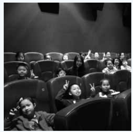
Children from the Changing Young Lives Foundation on Easter trip to the movies