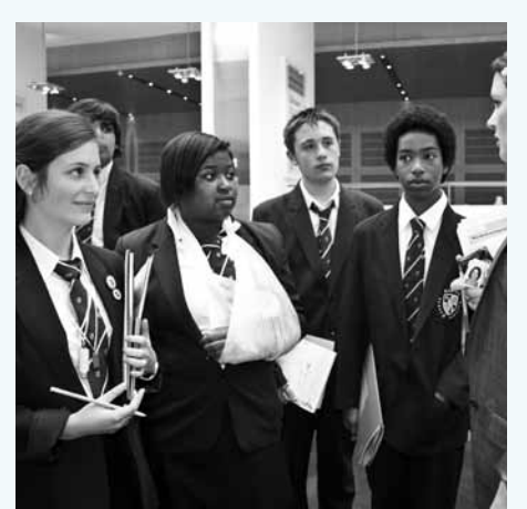
Students from Frederick Bremer School visiting our London office

Since early 2012, we have been developing an exciting programme with the Twist Partnership and representatives from across our offices. The aim of the