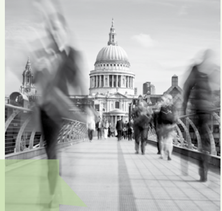
Simmons & Simmons "Walk to Client" programme

We have an international environment committee that meets quarterly, with members from all areas of the firm. We recognise that it is only with the support of our people that we can reduce the impacts of our business activities.