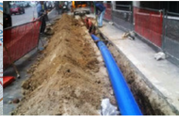
Interplast Super Strength RC Pipes