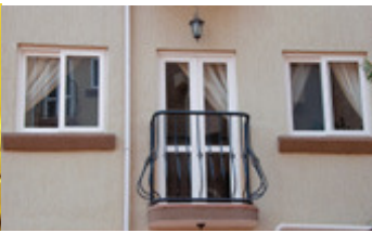
EVERLAST Doors & Windows