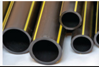
HDPE Gas Pipes