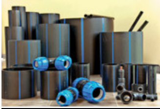
HDPE Pressure Pipes & Fittings