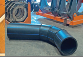
HDPE Hand Crafted Fittings