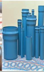
PVC Pipes & Fittings