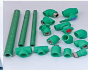
PPR Pipes & Fittings