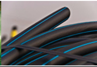
Cable Duct Systems