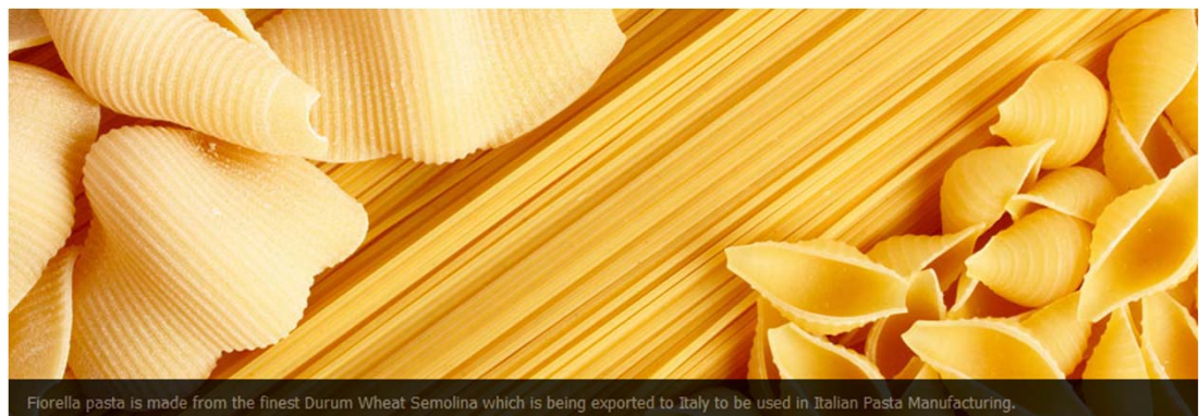
Fiorella pasta is made from the finest Durum Wheat Semolina which is being exported to Italy to be used in Italian Pasta Manufacturing.

The applied quality system is matching the large international companies' conditions, and internationally accepted standards.