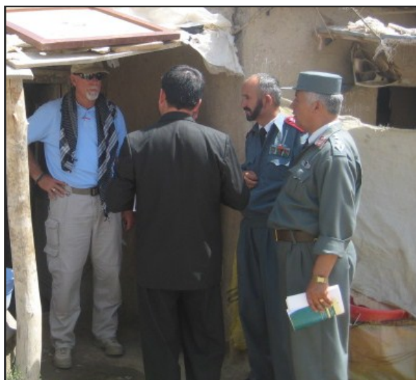
PAE employees are trained to be sensitive to the norms of all other cultures, while still abiding by the requirements of the U.S. government.

PAE's Code of Conduct provides guidance on how to respond to offers of gifts and courtesies, how to ensure ethical business operations, how to appropriately interact with former government employees, and how to navigate conflict of interest, bribery, and the Truth in Negotiations Act. PAE is dedicated to combating corruption of all kinds and stands firmly against abusing entrusted power for personal gain.