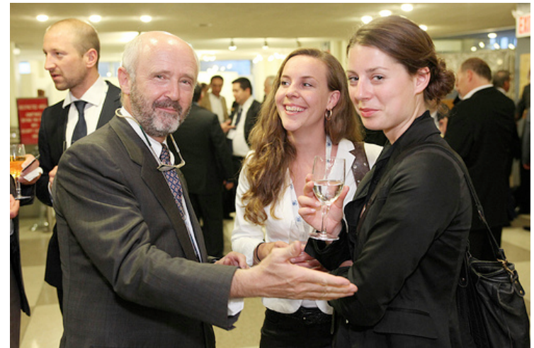
Welcome Session (23 June 2010), UN General Assembly Hall