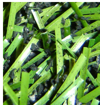
5 Year Wear