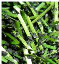
10 Year Wear