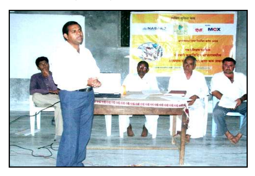
GSK coordinator briefing farmers on futures market

Creating awareness on commodity markets and making farmers awareness of price signals and its benefits is an important activity at MCX and the GSK platform is utilized for the same. Each GSK centre has a series of programs conducted year round that not only focuses on prices and GSK offerings, but also gives information of best sowing practices, use of pesticides and fertilizers, government schemes on agriculture, NABARD scheme, etc. GSK partners participate in the programs along with officials from NABARD, KVK and India Post officials.