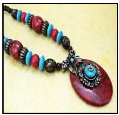
Some of the products available for online sale made by women artisans