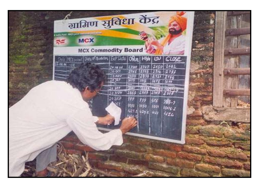
Village postmaster writing MCX commodity prices on black board