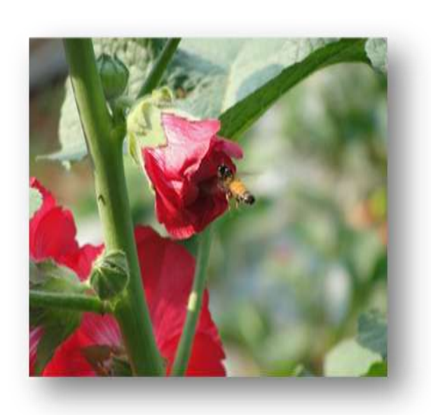
The best image entry on World Environment Day 2011

MCX has a well defined Environment Policy and E waste policy wherein it has tied up with two certified E waste recycler plants for disposal of its office E waste in a safe and environment friendly manner. Around 1600 asset count of e waste disposed through E waste recyclers in the financial year 2010-11.