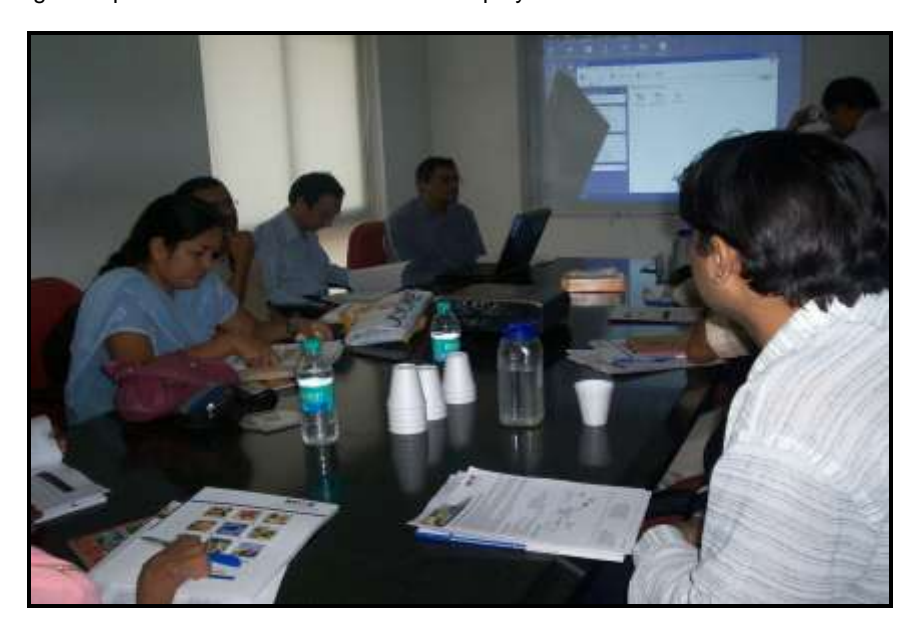
Specially challenged students undergoing MCCP training

The first of its kind, this program was aimed at making the specially challenged gain skills in the area of commodity trading. The batch had 12 candidates having different levels of disability ranging from Muscle Dystrophy, Polio, Neurological Disability, or Cerebral palsy. Candidates came from MBA foundation and the Spastic Society, both of which are NGOs working for the disabled. The MCCP course was followed by an online examination that was conducted after the completion of the course. It is aspired that through this course, the specially challenged acquired skills that enhanced their employment status.