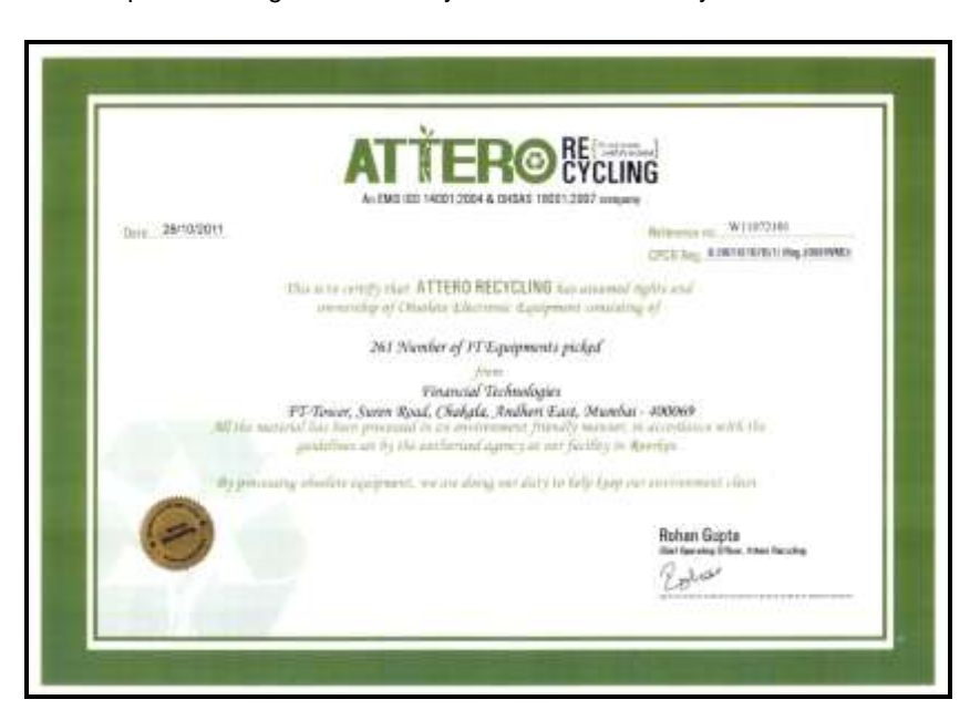
ATTERO Recycling certificate

MCX has a well defined Environment Policy and E waste policy wherein it has tied up with two certified E waste recycler plants for disposal of its office E waste in a safe and environment friendly manner. Around 1600 asset count of e waste disposed through E waste recyclers in the financial year 2010-11.