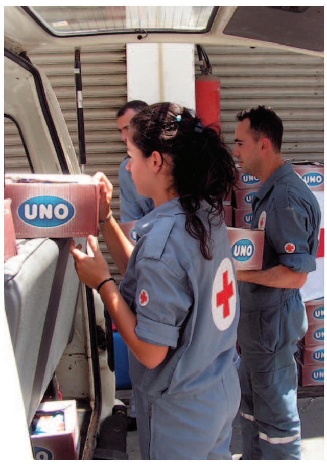
Supporting people in need in China and Myanmar

We are members of our communities and as such we find it important to contribute both financially and in kind.