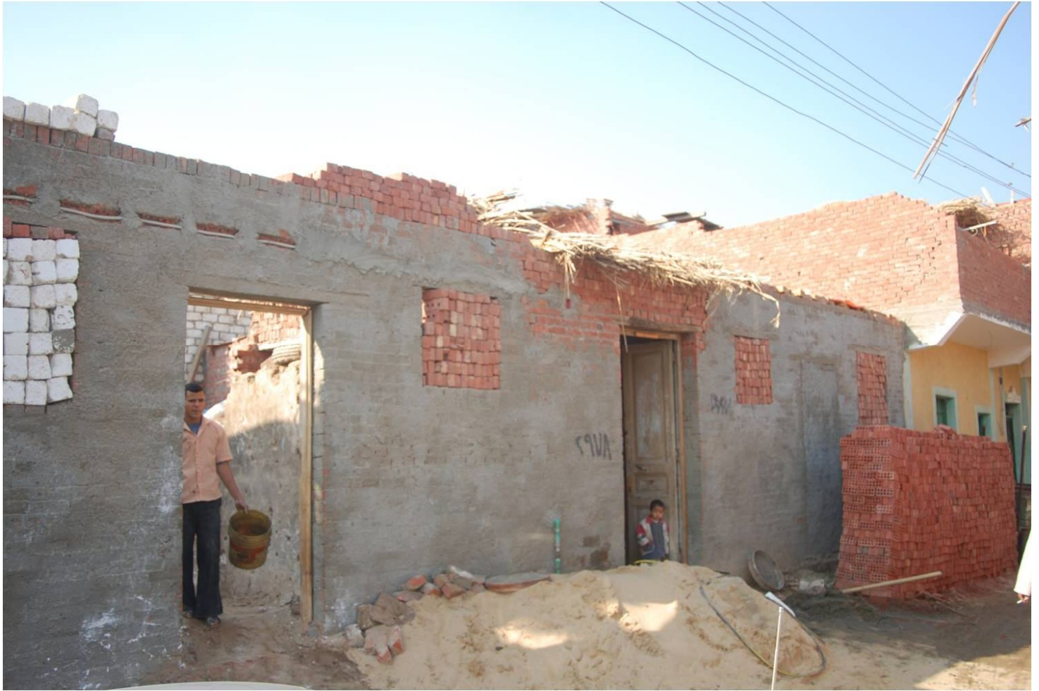
(A picture showing the building completed for the houses.)