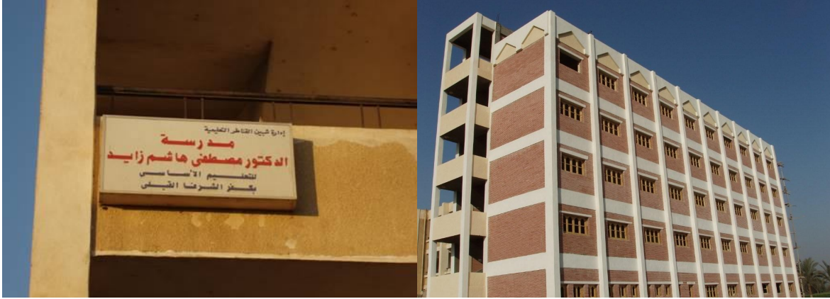
Picture of "Dr Moustafa Hashem Elementary school" built early 1995 Kafr El Shorafa / Kalyoubeya / Egypt