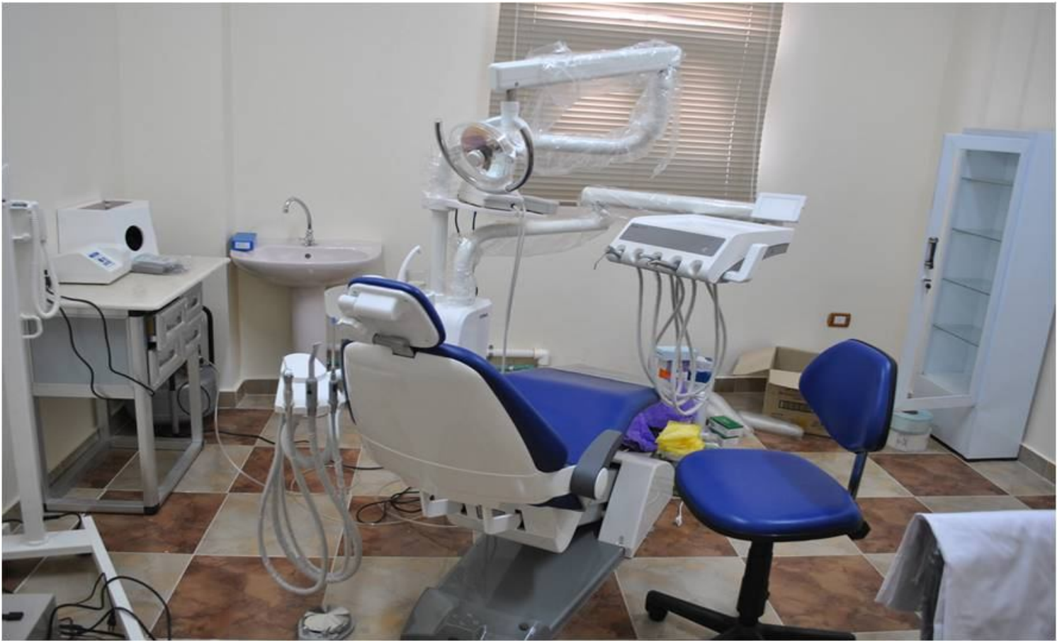
(A picture for the dental clinic)