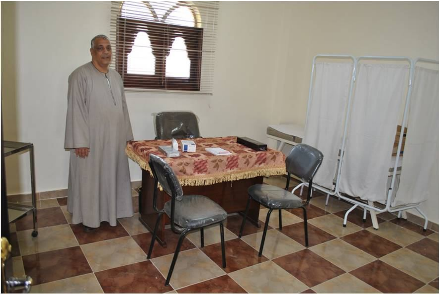
(A picture for the general health clinic)