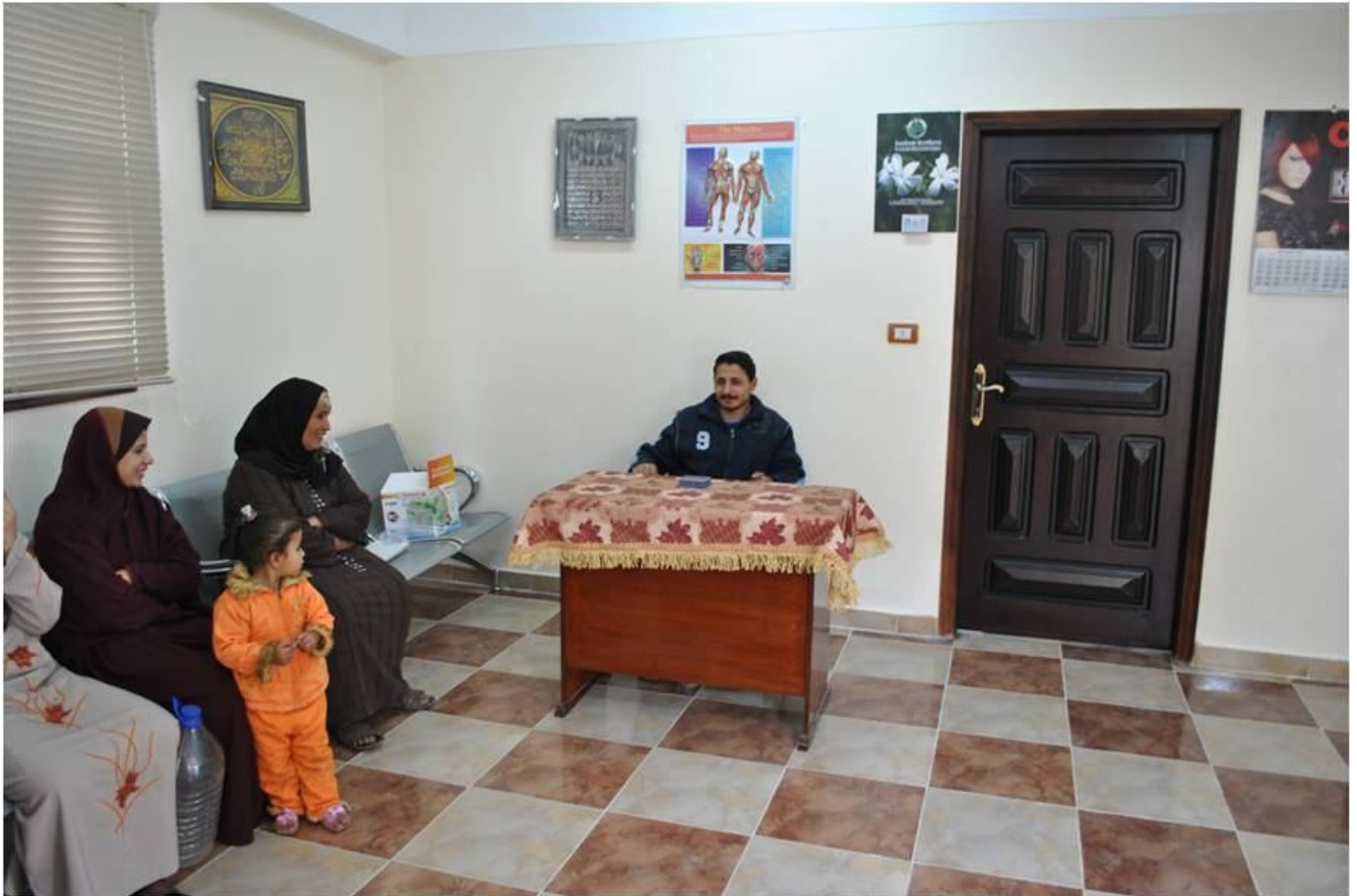
(A picture for the gynecology clinic)