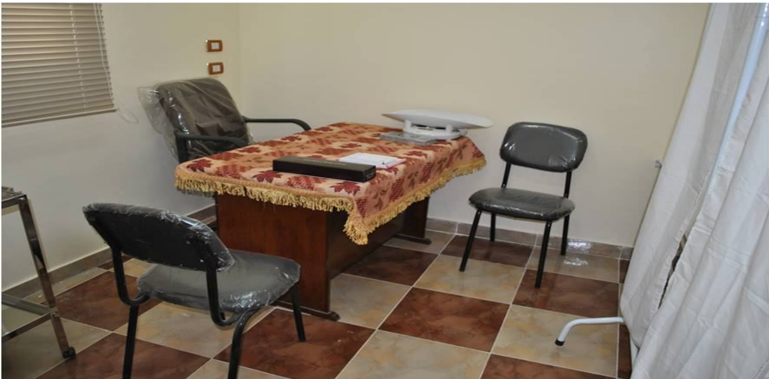
(A picture for the child care clinic)