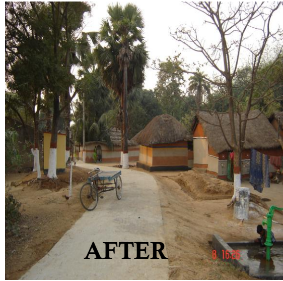
(MSV Akandra, DSP)