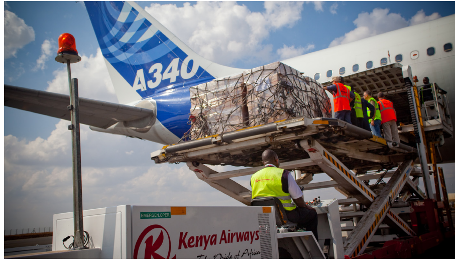
Left: Unloading Compact's emergency food rations from an Airbus machine at the airport in Kenya July 2011. Below: BP-5, the high energy, wheat-based emergency-"bar" developed for the initial phase in a disaster area.