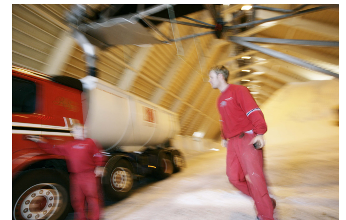
Top: MG Kombi, GC Rieber Salt's environmental friendly alternative for salting of roads. Above: Preparation and loading of the car at GC Rieber's terminal i Ålesund, Norway, before salting of roads.