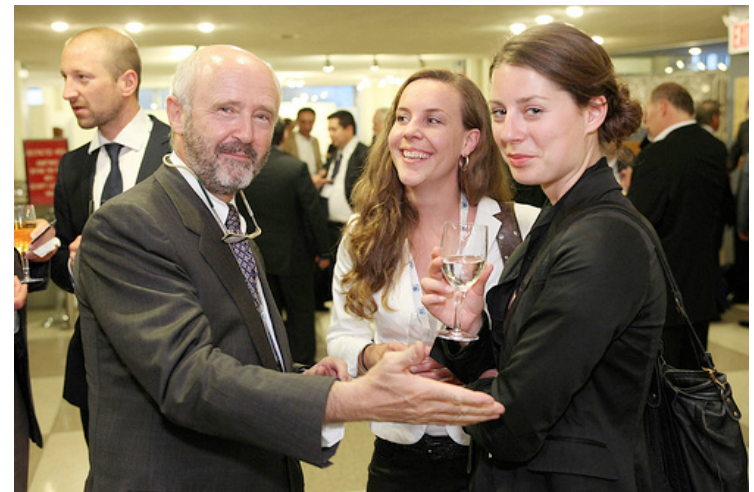
Welcome Session (23 June 2010), UN General Assembly Hall