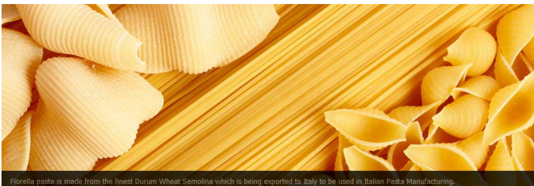
Fiorella pasta is made from the finest Durum Wheat Semolina which is being exported to Italy to be used in Italian Pasta Manufacturing.

The applied quality system is matching the large international companies' conditions, and internationally accepted standards.