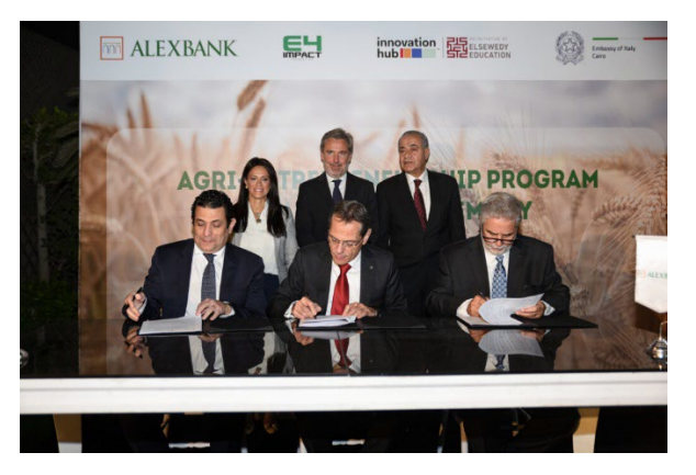
E4Impact signes and MOU with El Sewedy Education and ALEXBANK to launch an Agri-Entrepreneurship Program in Egypt, October 2022