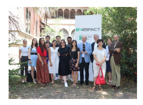
E4Impact team recognised with the "Innovation and Entrepreneurship Program of the Year Award", during the Triple E Awards, June 2022.