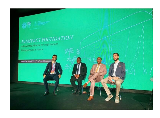
E4Impact and UCSC event in the Italian Pavilion of the Expo Dubai, October 2021

<u>In November 2022</u> E4Impact launches the 1<sup>st</sup> Accelerator in Uganda.