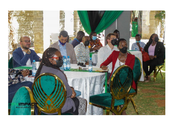
Launch of the new phase of the E4Impact Accelerator in Nairobi (Kenya), Novembre 2021