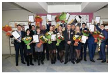
Winners at UDM Youth Forum

CIR holds various training of professional skills, industrial safety, occupational safety and environmental protection. In 2017, KKM company organised 471 person-time of business training and 359 person-time of industrial safety training; Arman organised 64 person-time of various training. UDM establishes a set of collaborative training model covering high school, college and enterprise, and adds special course of oil industry to provide students with more job opportunities. UDM also holds youth science and technology forums and professional skill competitions to promote exchanges of science and technology outcomes among employees and improve employees' career development.