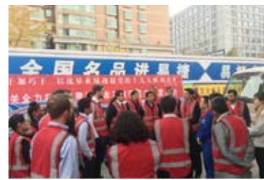
Trainees of the 6th training course for key positions of overseas employees participate in research tours of domestic oilfields, refining & chemical, engineering and sales enterprises