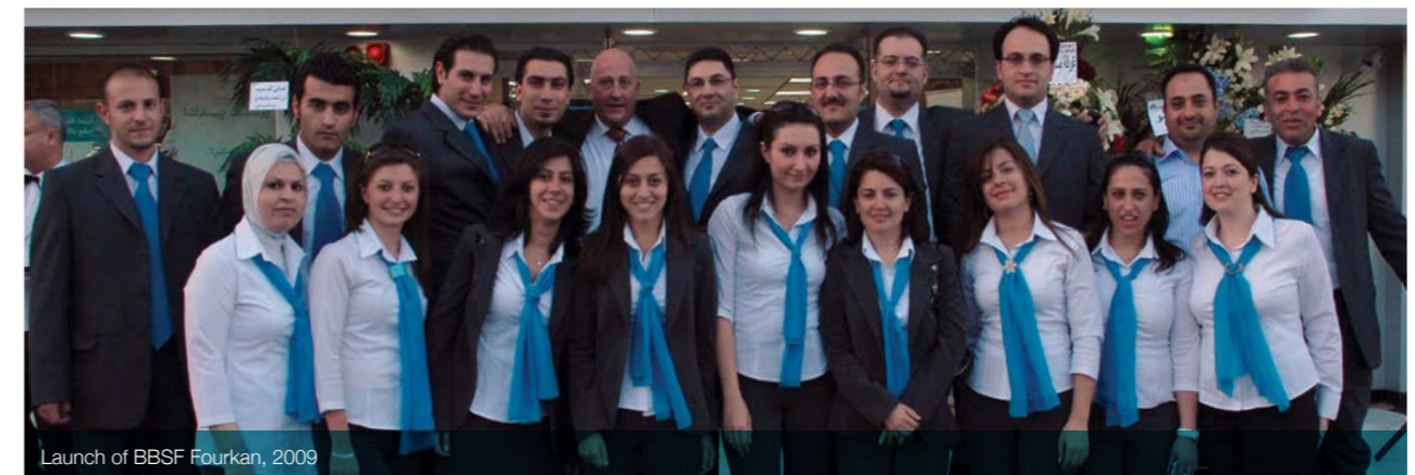
Launch of BBSF Fourkan, 2009