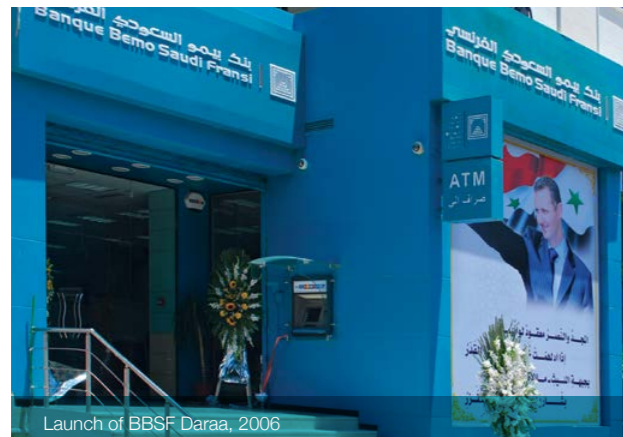
Launch of BBSF Daraa, 2006