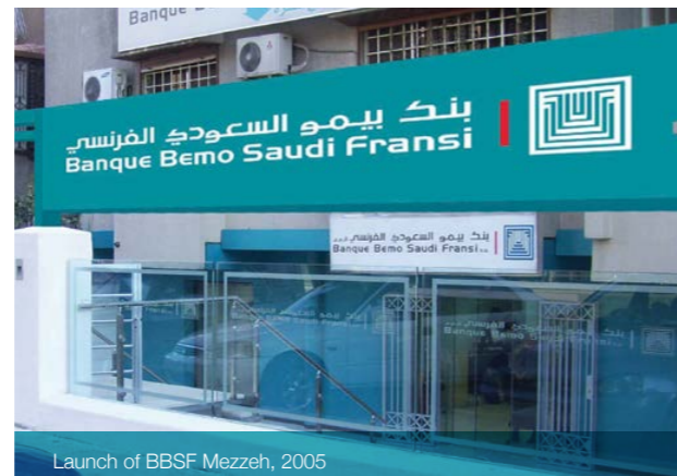
Launch of BBSF Mezzeh, 2005