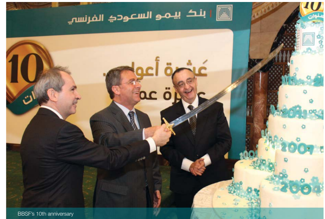
BBSF's 10th anniversary