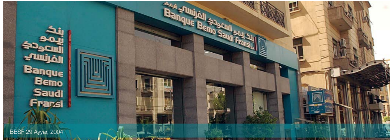
BBSF 29 Ayyar, 2004

Today while celebrating our 10th year, we want to remember our important achievements which make us feel like the first family to involve in the banking business in Syria.