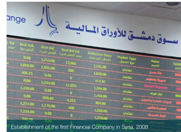
Establishment of the first Financial Company in Syria, 2008