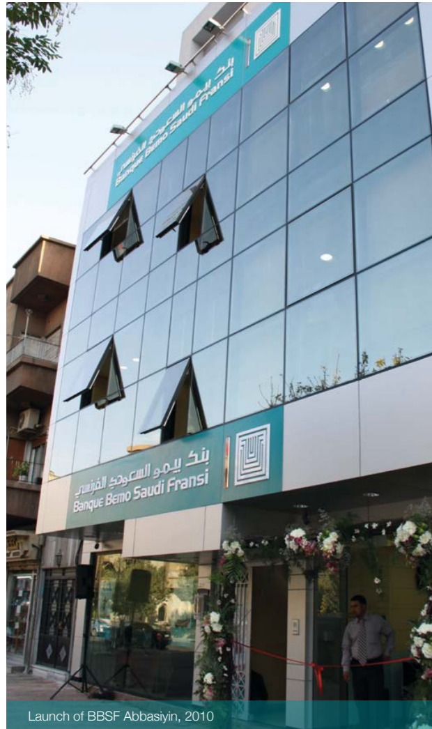
Launch of BBSF Abbasiyin, 2010