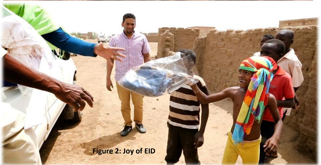
Figure 2: Joy of EID