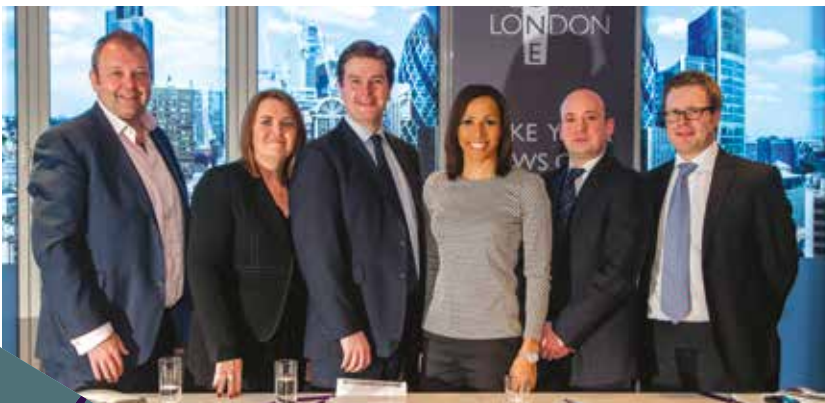
Photo: RSA volunteers join Dame Kelly Holmes (fourth from left) to support young people.

Financial literacy and entrepreneurship are the focus of partnerships with Junior Achievement in Ireland and Lithuania. This year seven volunteers delivered life skills training to 138 students in five local schools across Galway and Dublin. Primary school children discovered the simple principles of earning and saving via story books and stickers. Secondary students learned about local elections, tax and enterprise. Others gained practical skills on how best to apply for jobs. In Lithuania, staff welcomed students to their offices for a taste of the world of insurance.