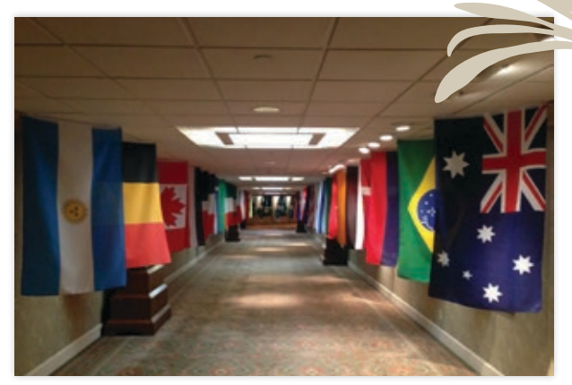
Flags displayed for each country represented at the 2013 Cartus Global Network conference.