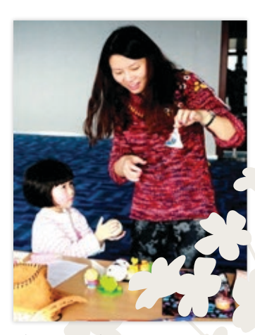
Charity Family Day—Cartus, Shanghai.