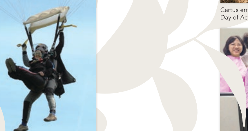
A UK employee took her first skydive for charity.