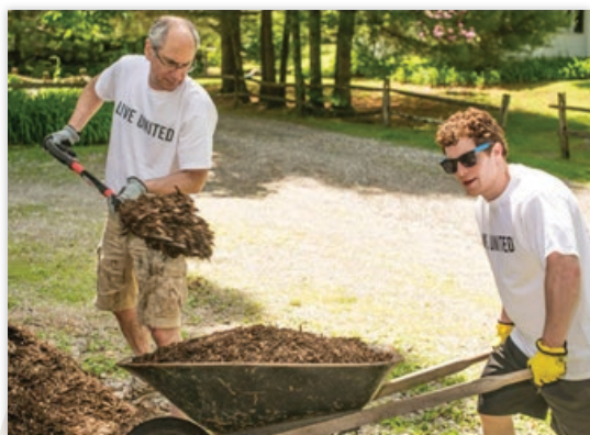
Cartus employees participate in United Way's annual Day of Action.