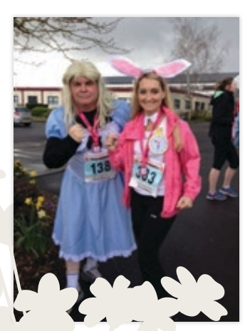
Swindon's Mad March Hare 10K Run.