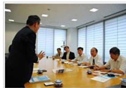
Meeting with Officials from Vietnam

On the day of the visit, the group was briefed on our implementation and execution of OSHMS, educational system, and case studies of our success in improving our work environment over the years. They also visited the clinical center to observe the MRI and CT equipment that we have installed, and to exchange information regarding health management with our industrial physician. The group observed our safety and health system and activities extensively, and intently inquired into our educational and training programs, employee awareness plans, and legal basis of such programs and activities.