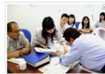
Management audit at Yokogawa Electric China Co., Ltd. (Suzhou)