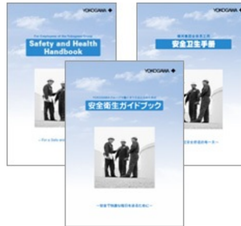
Safety and Health Guide Book

To ensure that the "Yokogawa Group Safety and Health Policy" is adhered to across the entire Yokogawa Group, the "Safety and Health Guide Book," which contains basic information and day-to-day rules regarding safety and health, has been created and distributed to all staff and engineers at every Yokogawa Group company. To maintain and improve all levels of activities throughout, persons in charge, committee members and newly appointed personnel are educated through safety and health committee workshops, as well as on-site safety training at customer plants and factories.