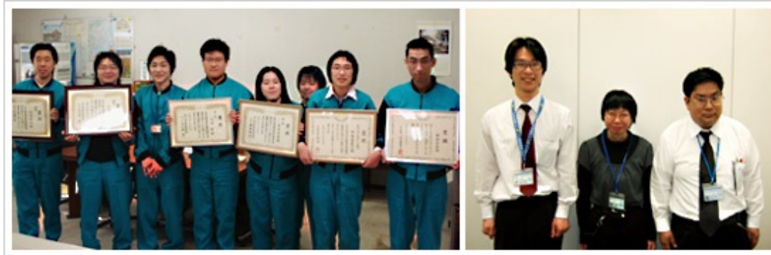
A lot of employees challenge in the Abilimpics every year.